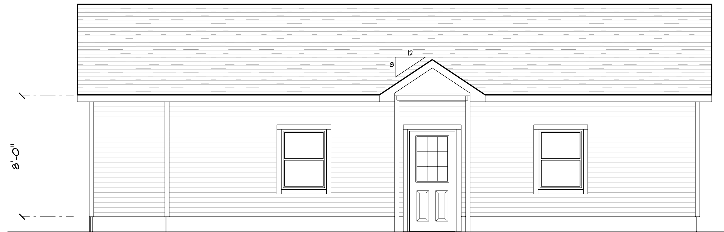
RIGHT ELEVATION SCALE: 1/4" = 1'-0"