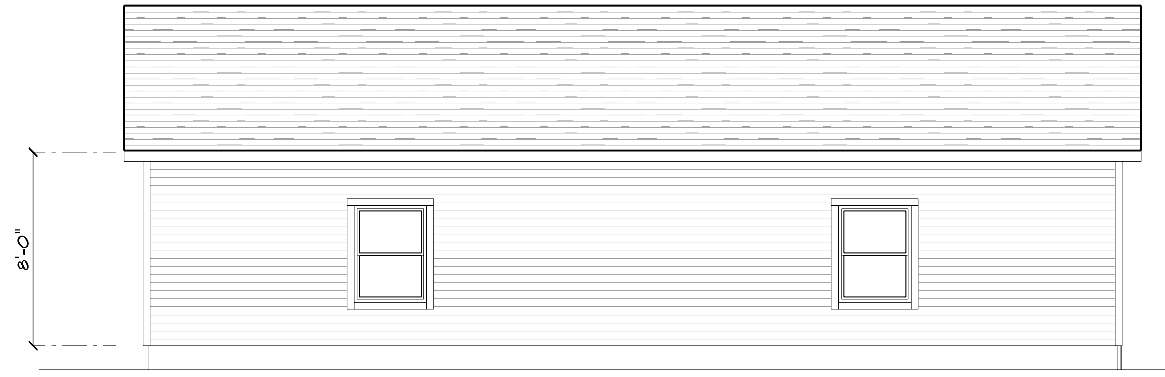
LEFT ELEVATION SCALE: 1/4" = 1'-0"