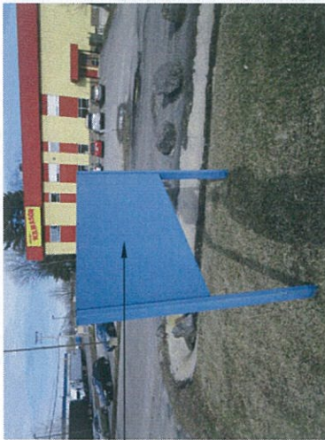
PHOTO AT EXISTING SIGN BACK

REPAINT EXISTING SUPPORTS AND SIGN BACK, SATIN BLACK