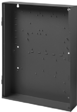
Model FHB2002-U1 [for Two-Height-Unit Enclosures]

Approximate size: 28.5" (72.4 cm.) [H]; 28" (71.2 cm.) [W]; 6.0" (15.2 cm.) [D]