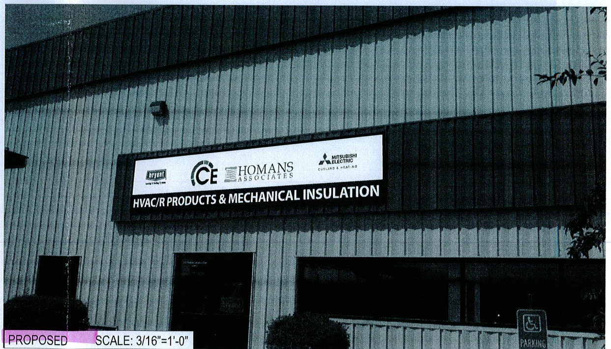
PROPOSED SCALE: 3/16"=1'-0"