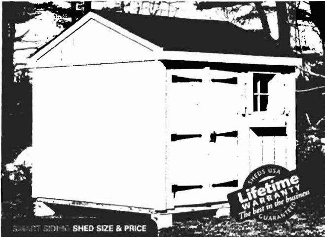
SMART SIDING SHED SIZE & PRICE

8' x 12' extended peak roof white/gray shingles Options: gable vent