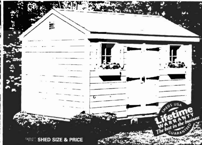
PINE SHED SIZE & PRICE