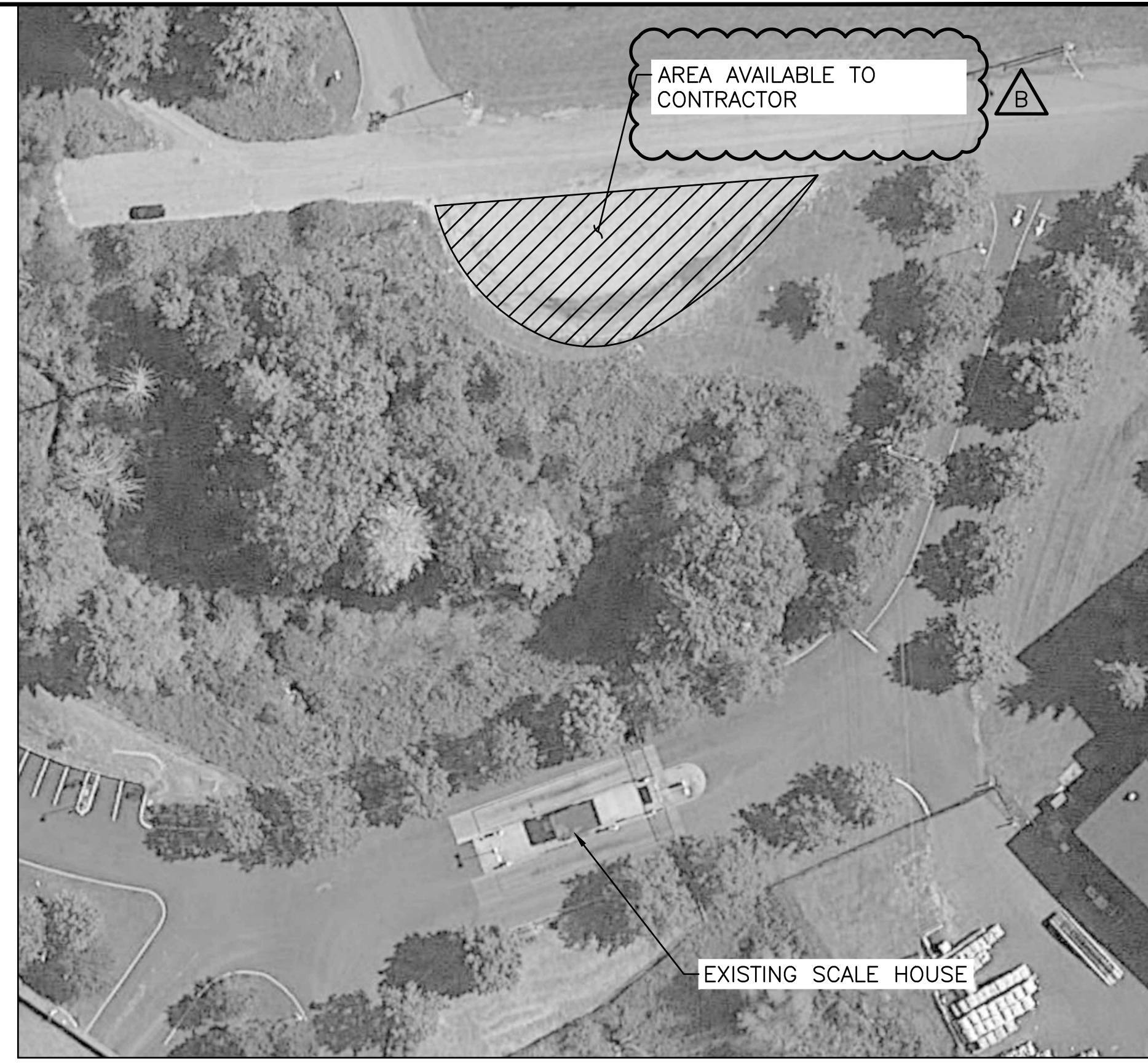
CONSTRUCTION LOCATION MAP SCALE: NTS

ISSUED FOR BID NOT FOR CONSTRUCTION JANUARY 5, 2017