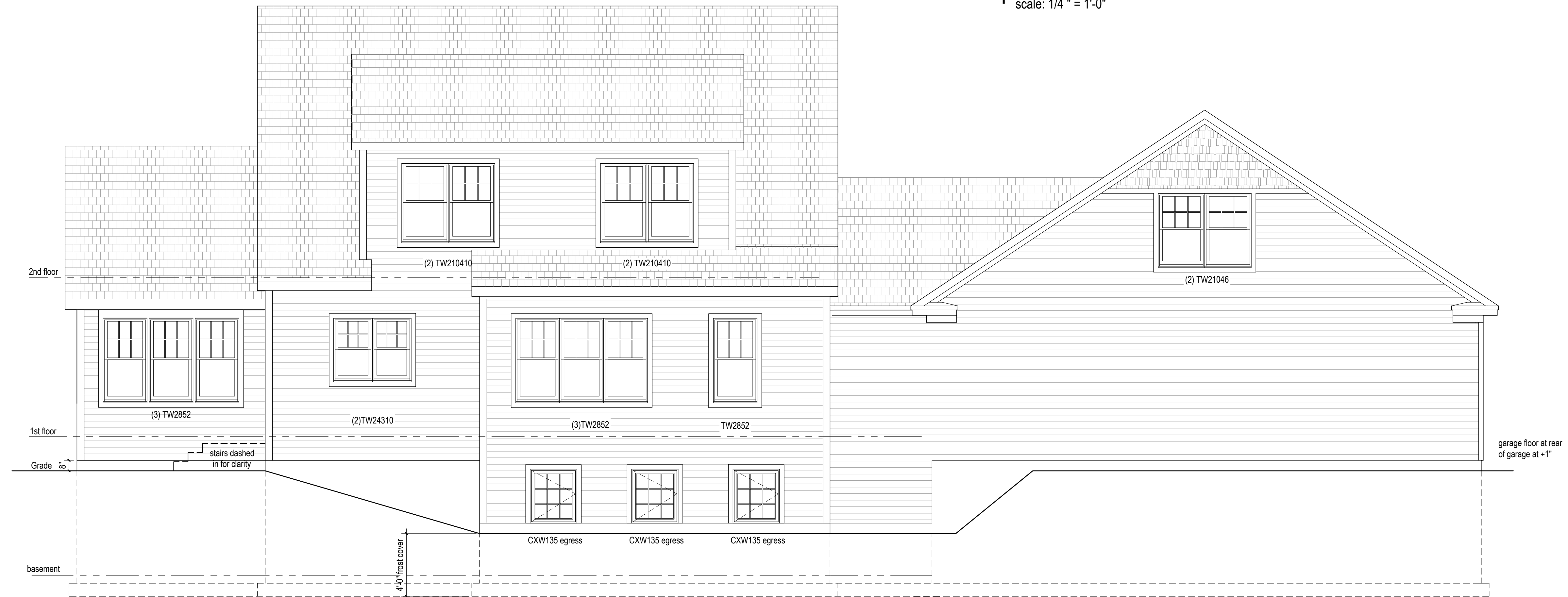
2 North Elevation scale: 1/4" = 1'-0"