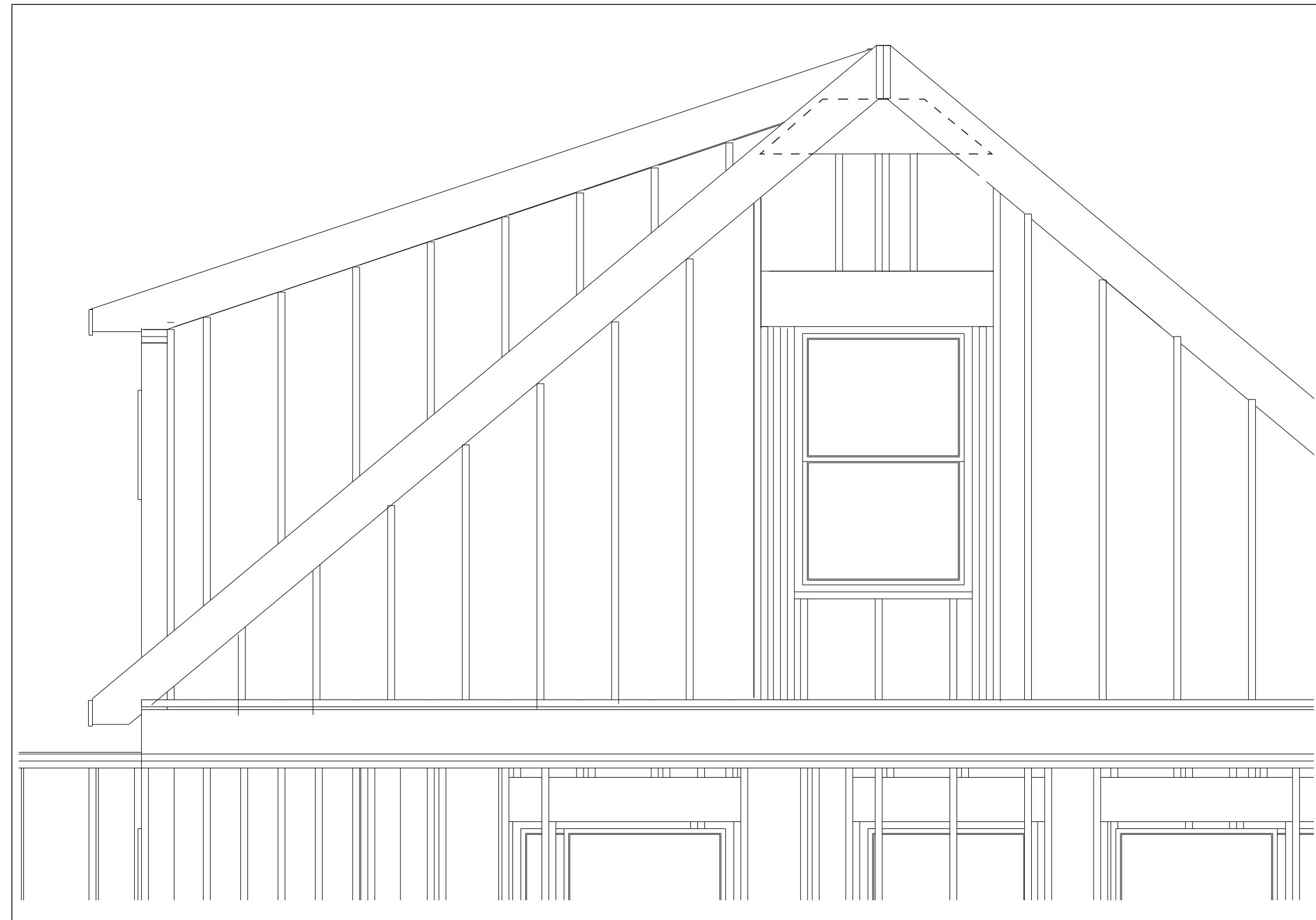
PROPOSED DORMER GABLE FRAMING SCALE: 1/2" = 1'-0"