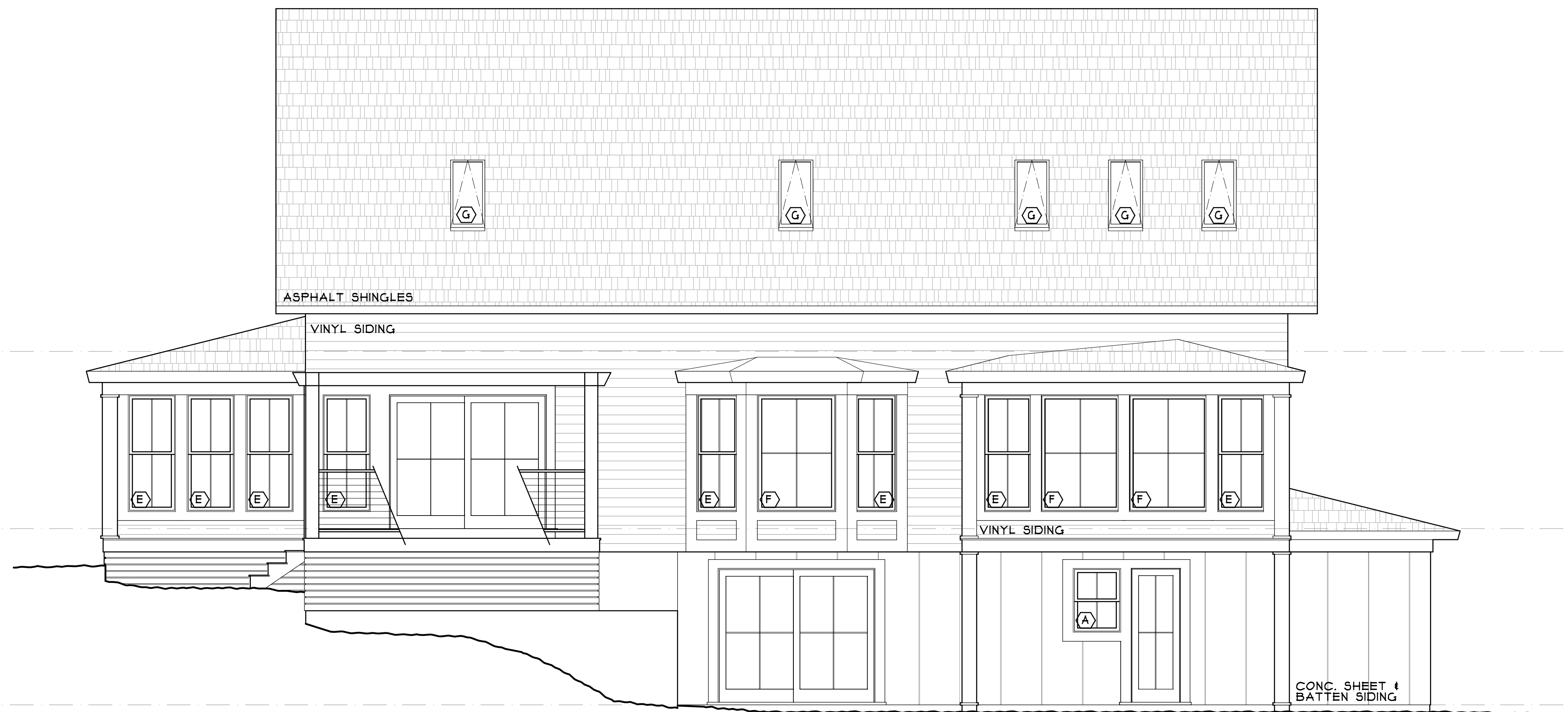
2 SOUTHEAST ELEVATION 1/4" = 1'-0"