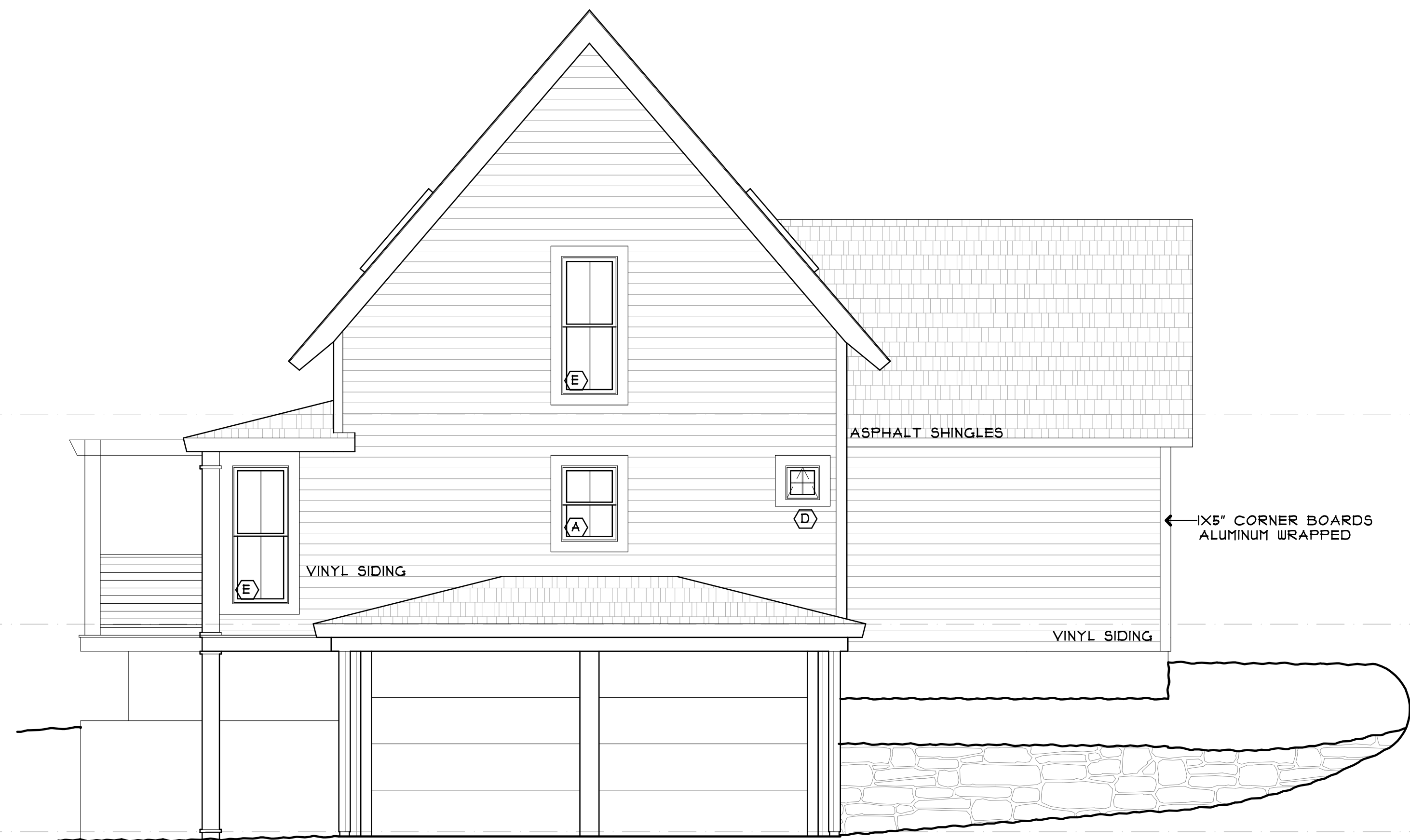
1 NORTHEAST ELEVATION 1/4" = 1'-0"