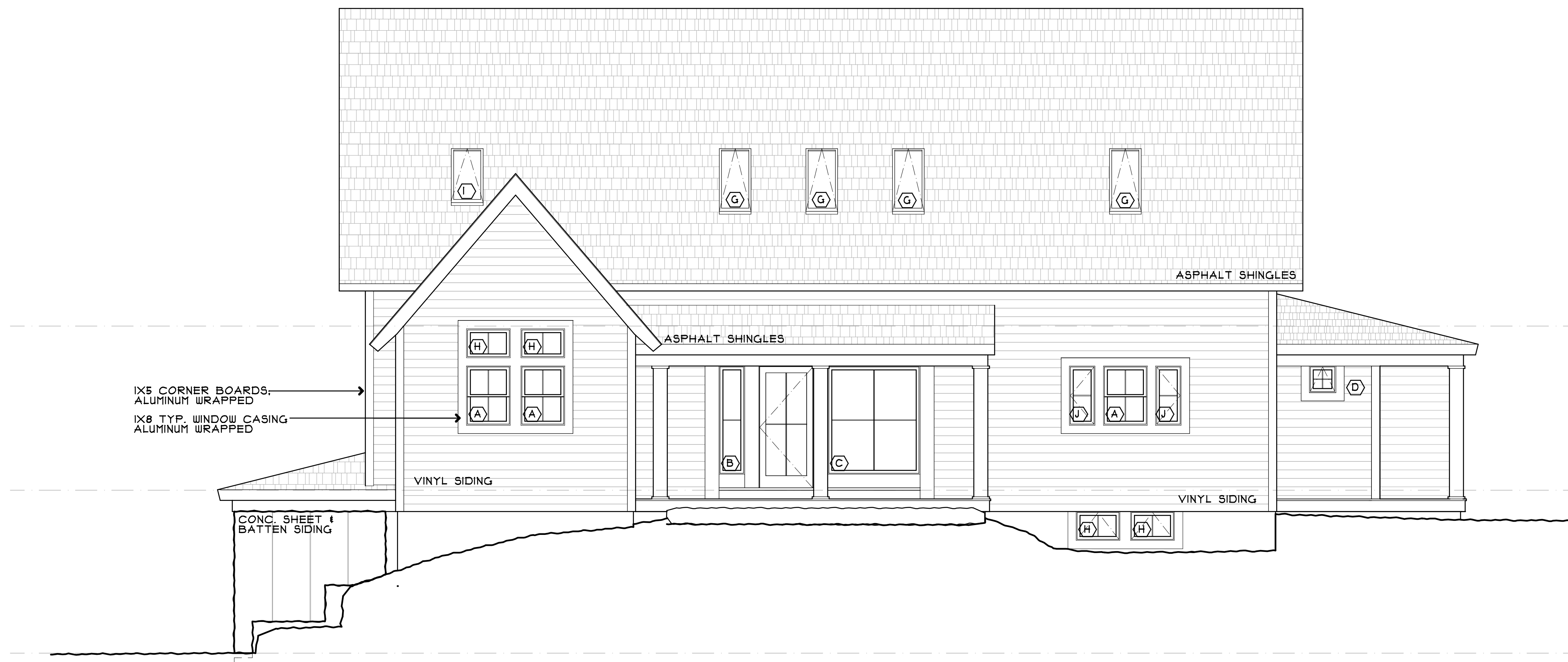
1 NORTHWEST ELEVATION A.I.I. 1/4" = 1'-0"