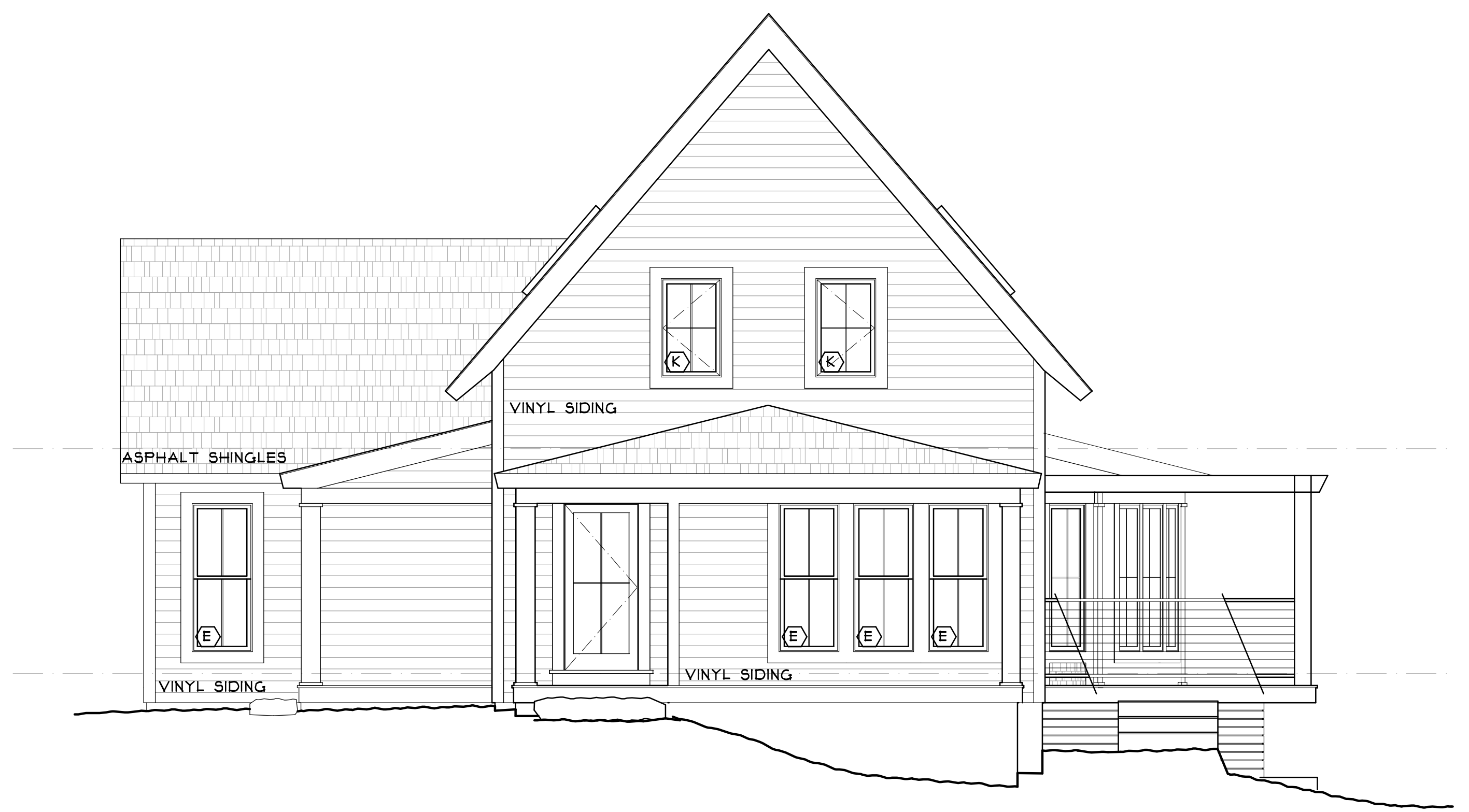
2 SOUTHWEST ELEVATION A.I.I. 1/4" = 1'-0"