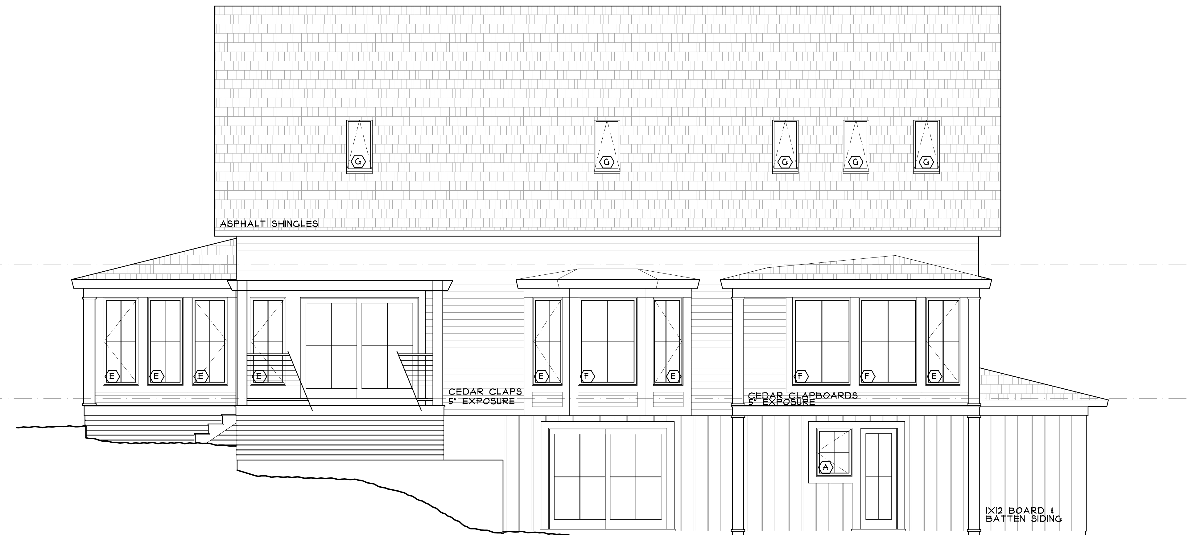
2 SOUTHEAST ELEVATION 1/4" = 1'-0"