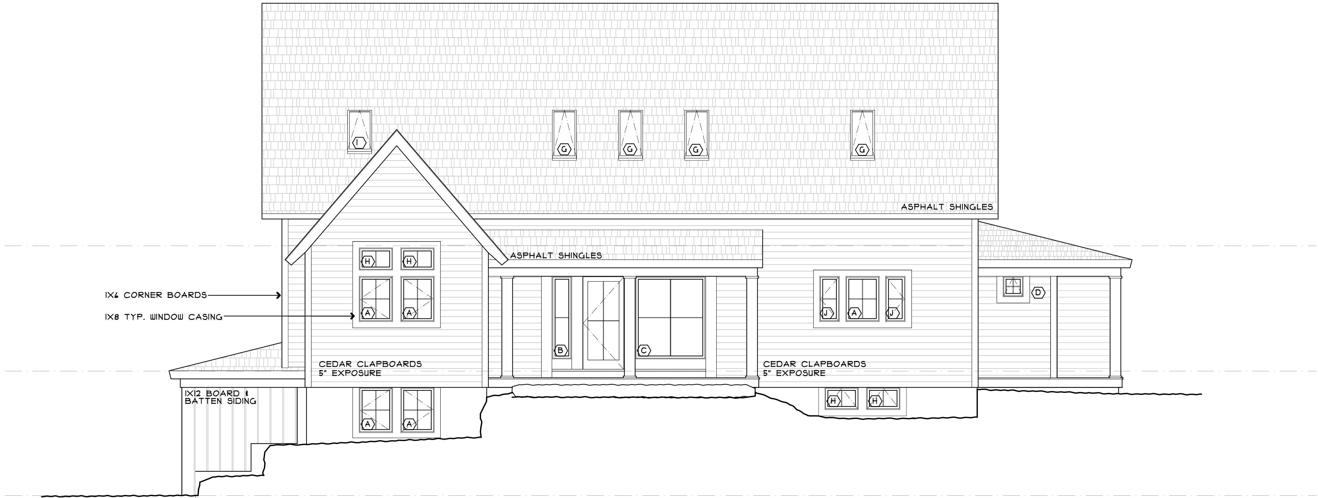
1 NORTHWEST ELEVATION A1.1 1/4" = 1'-0"