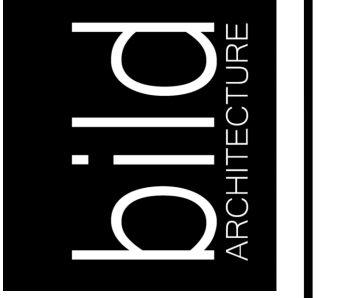
Bild Architecture PO Box 8235 Portland, ME 04104 207.408.0168 evan@bildarchitecture.com