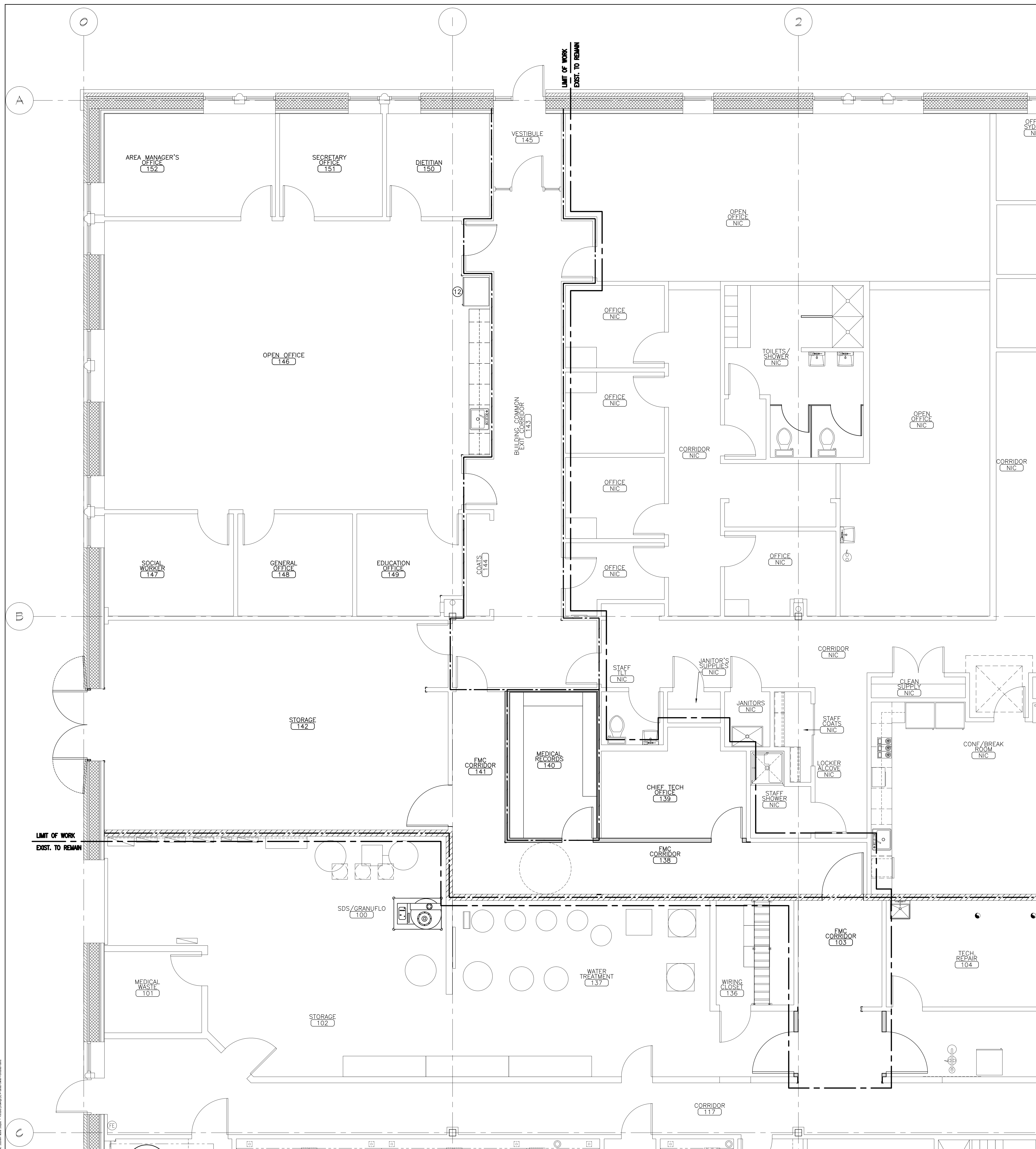
A OWNER FURNISHED ITEMS PLAN SCALE: 1/4" = 1'-0"