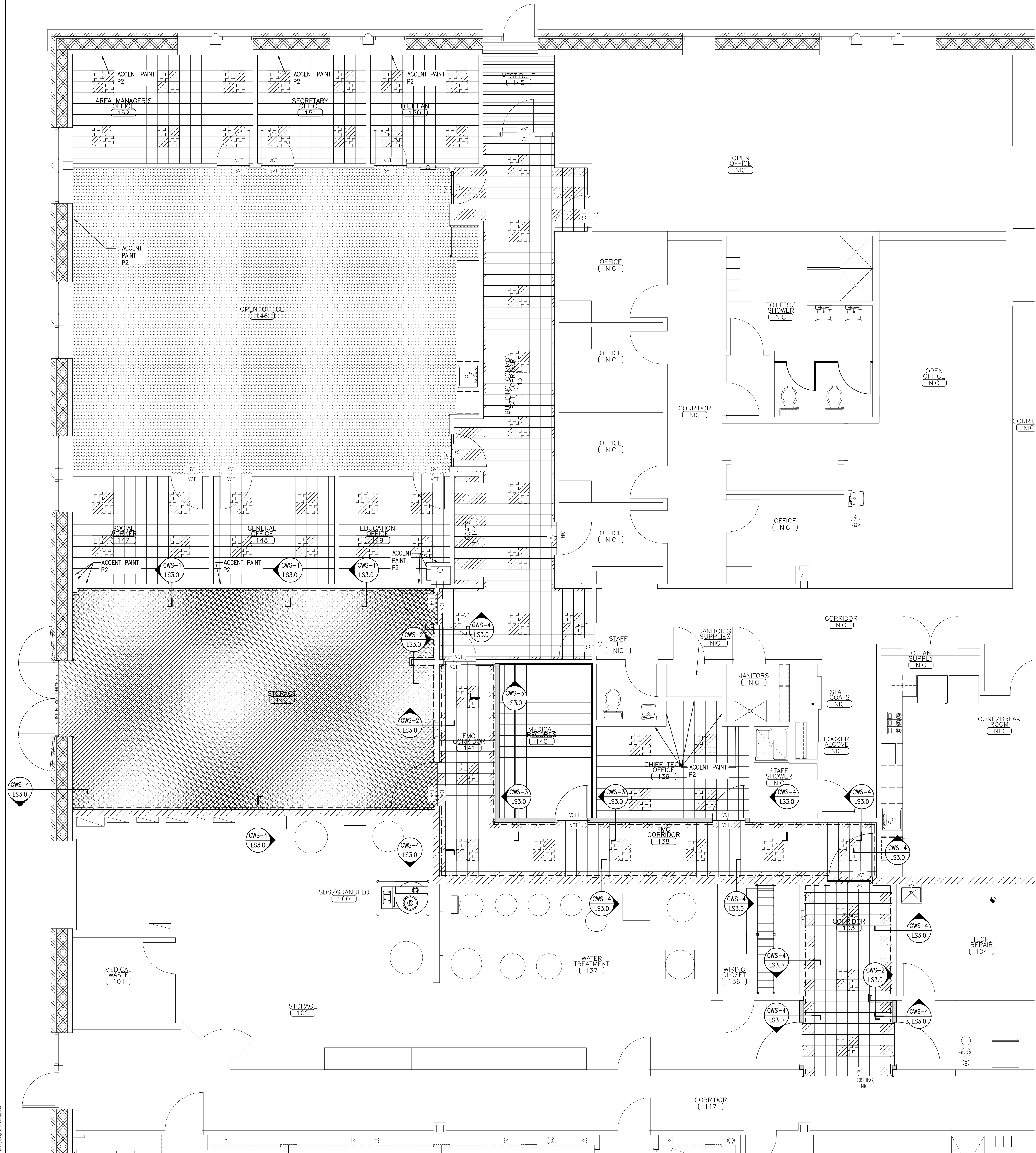
A A2.3 FLOOR FINISHES PLAN SCALE: 1/4" = 1'-0"