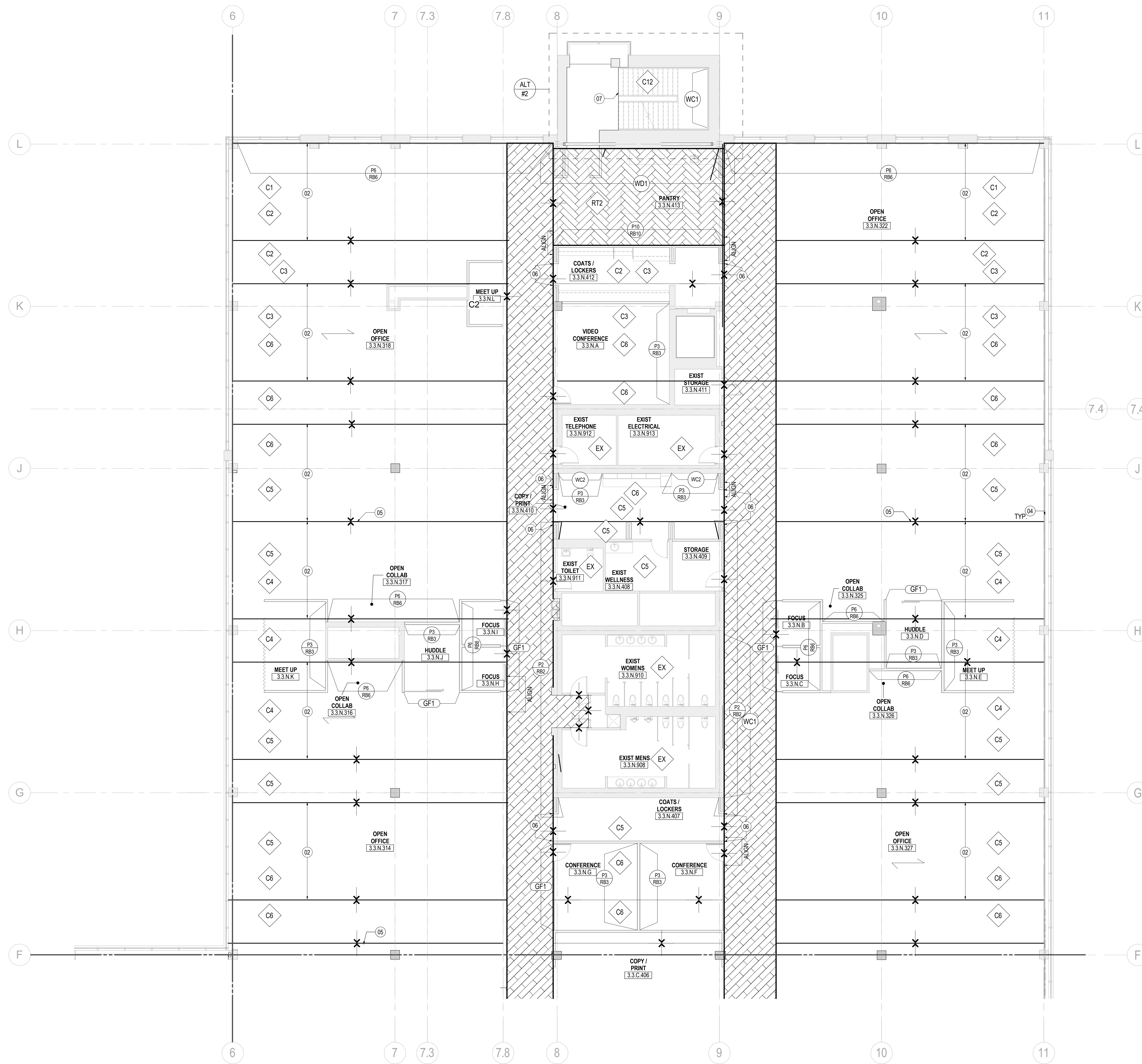
1 FINISH PLAN - LEVEL 03 - AREA N SCALE: 1/8" = 1'-0"

12/15/2017 2:44 PM I:\gms\ad\projects\Revit\Level\Area\03-1-UNUM - PORTLAND - HO3 - 2016_2516B.rvt