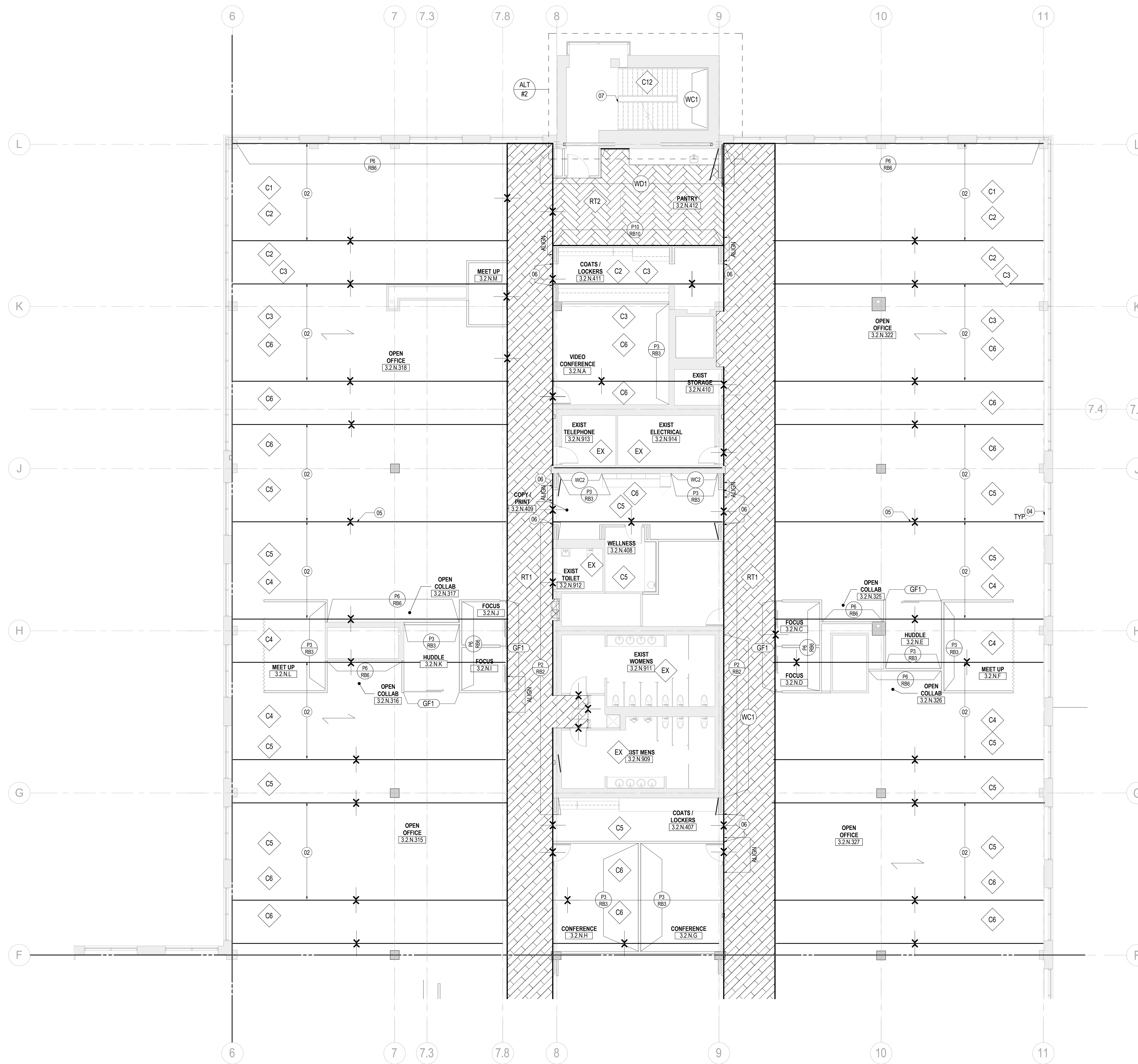
1 FINISH PLAN - LEVEL 02 - AREA N SCALE: 1/8" = 1'-0"

12/15/2017 2:40:57 PM I:\gms\ad\projects\Revit\Level\Area\02\5.68559.6481.003-UNUM-PORTLAND-HO3_2016_25168-N.dwg