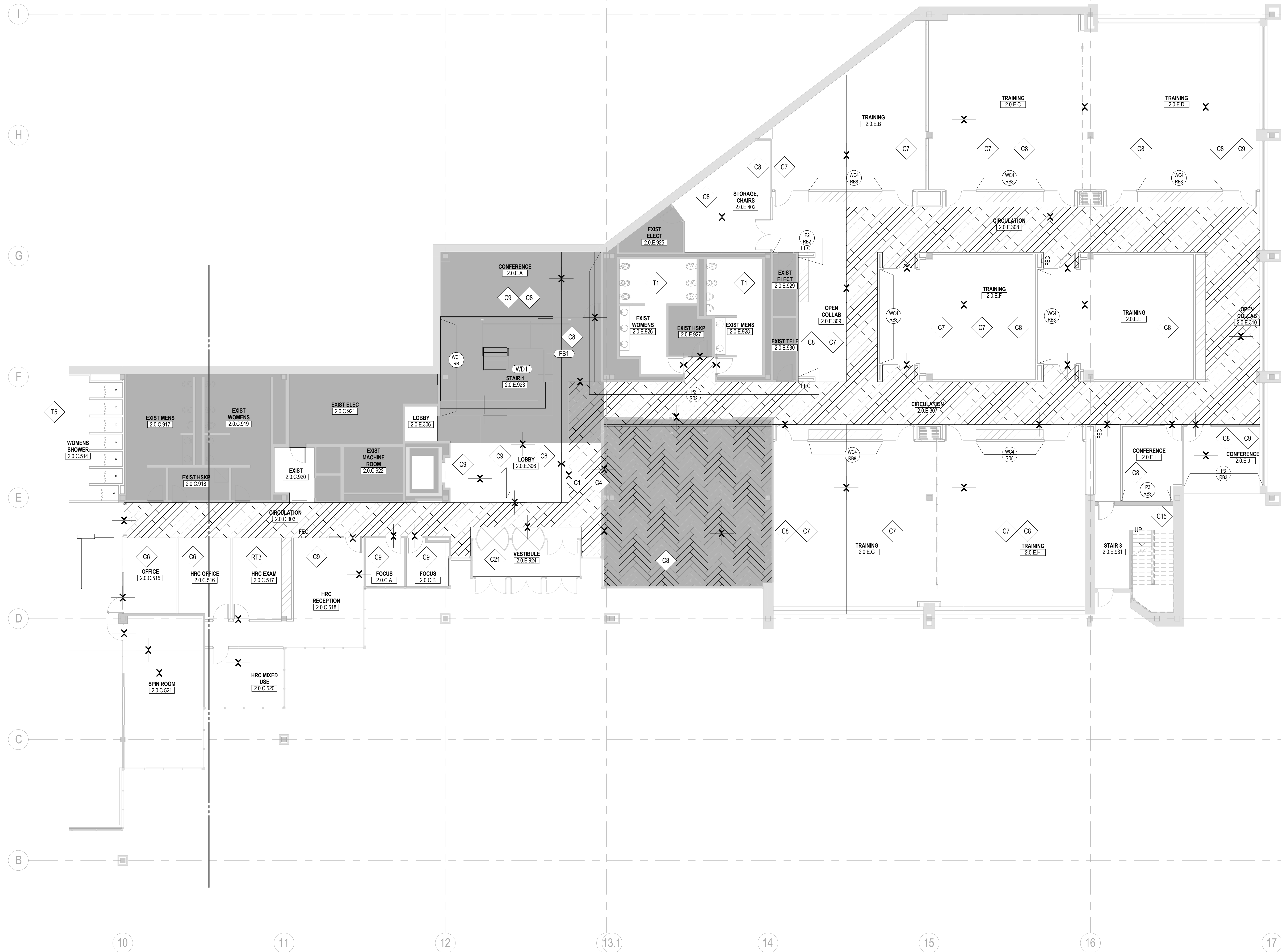
1 FINISH PLAN - LEVEL 00 - EAST - PH3 SCALE: 1/8" = 1'-0"