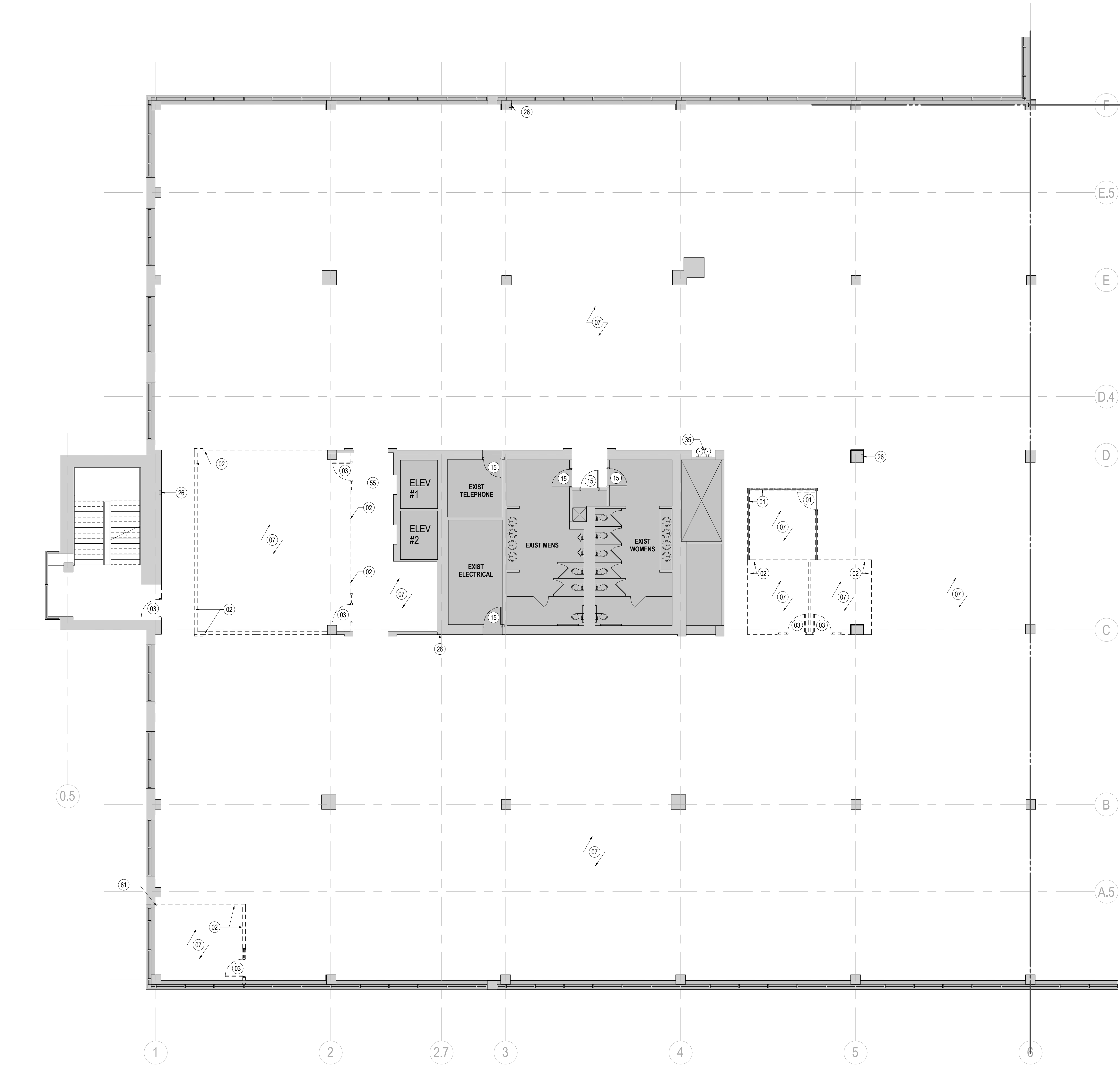
01 DEMOLITION PLAN - LEVEL 03 - AREA W SCALE: 1/8" = 1'-0"

12/15/2017 2:09:24 PM \\gensler-ad\projects\Revit\Level\Area\03-UNUM - PORTLAND - HO3_2016_25168.rvt