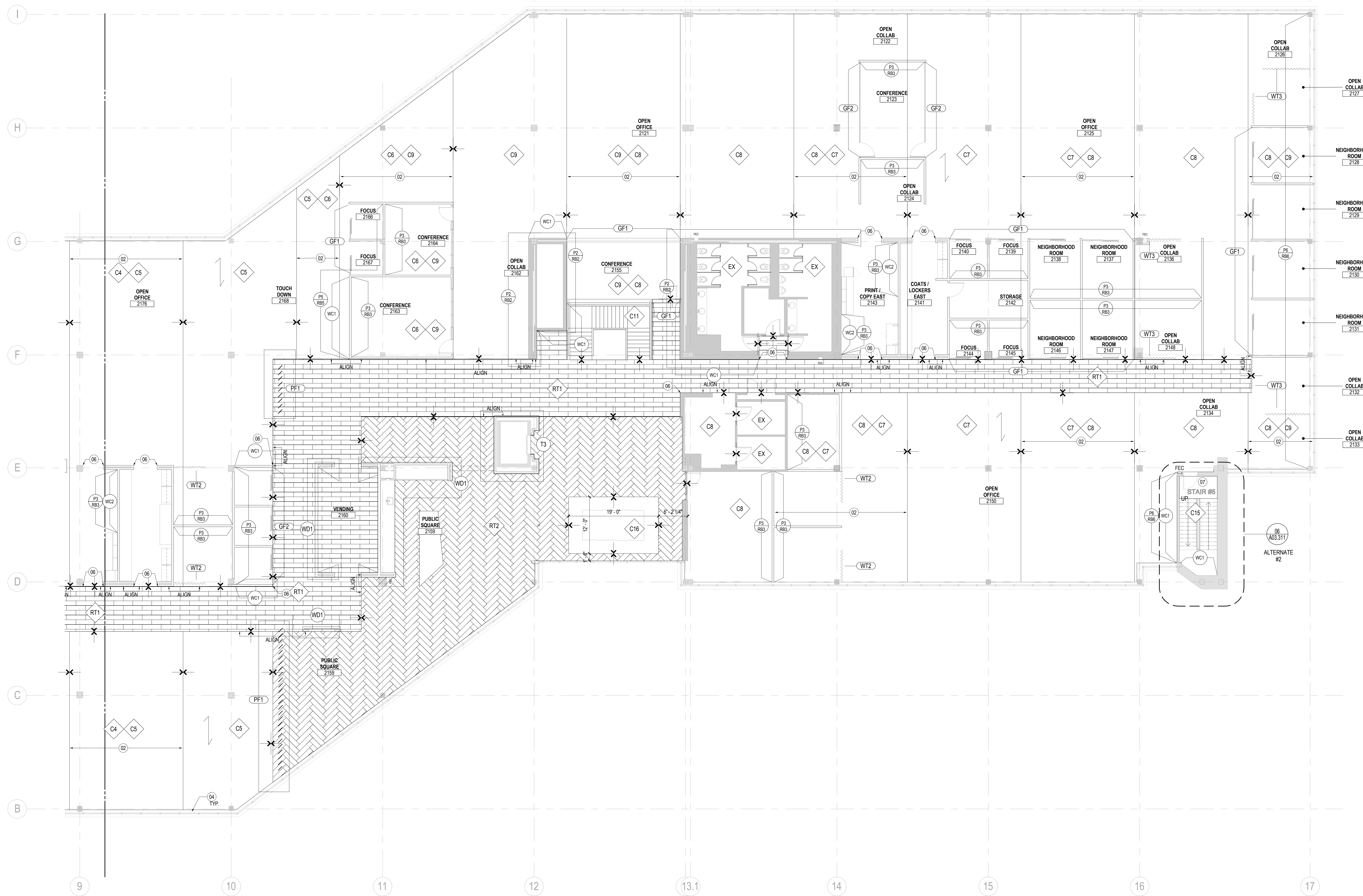
01 FINISH PLAN - LEVEL 02 - EAST SCALE: 1/8" = 1'-0"

8/10/2017 6:57:35 PM I:\gensler\ad\projects\Revit\Unum\Unum\PORTLAND - HO2 - 2016 - MichaelThomas\Gensler.rvt