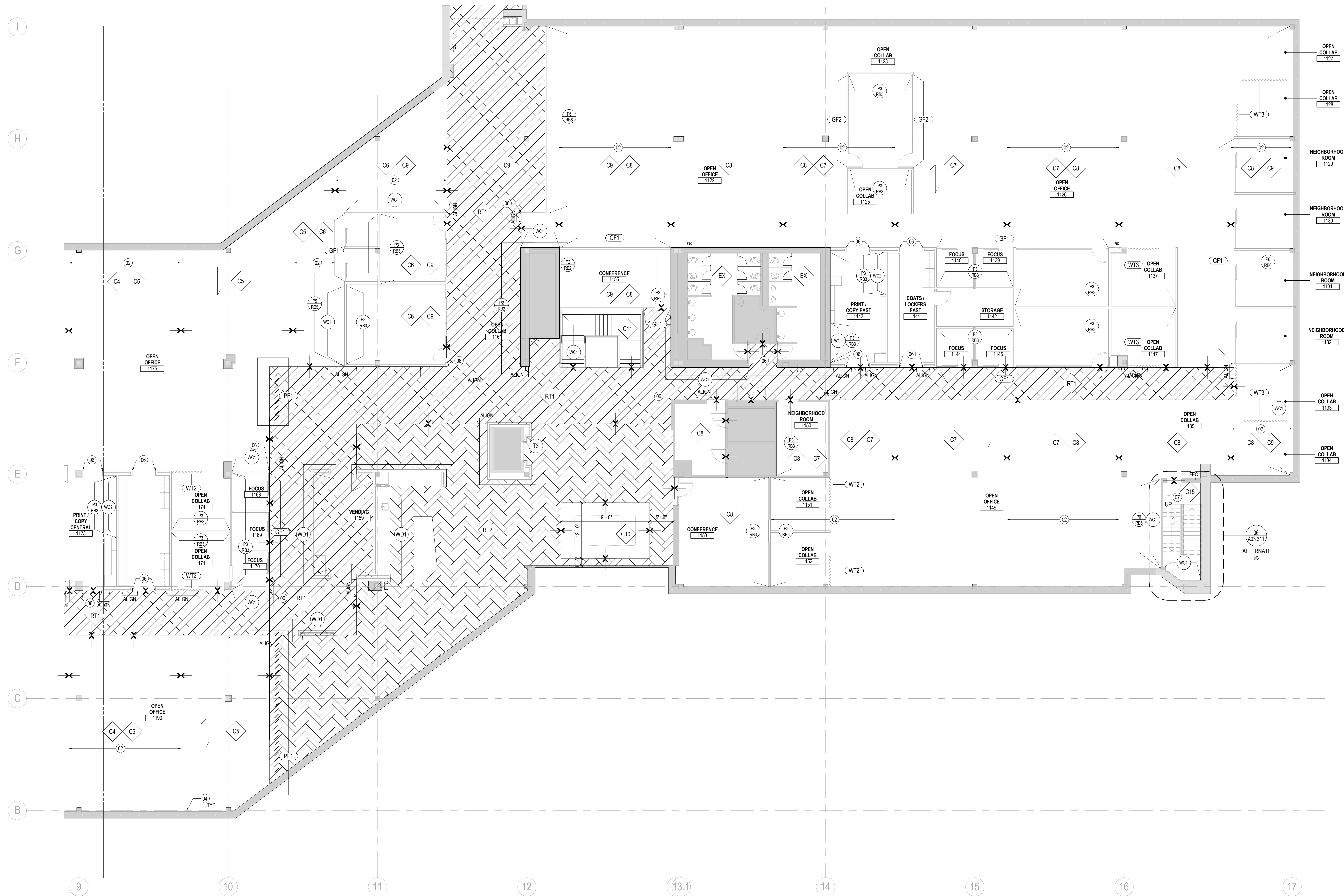
01 FINISH PLAN - LEVEL 01 - EAST SCALE: 1/8" = 1'-0"

SHEET NOTES 02 REFER TO DETAIL 05/A08.200 FOR CARPET TRANSITION INSTALL. CONTRACTOR TO COORDINATE ON SITE MOCKUP INSTALL OF CARPET TRANSITION FOR ARCHITECTS APPROVAL PRIOR TO INSTALLATION OF FINAL PRODUCT. 04 ALL EXISTING WINDOW SILLS TO BE PAINT SPRAYED SEMI-GLOSS. TYPICAL THROUGHOUT ENTIRE FLOOR PLATE. 06 GC TO PROVIDE AND INSTALL CLEAR CORNER GUARD. REFER TO SPEC ON SHEET A00.020 07 STAIR SCOPE ITEMS TO BE PART OF ADD SERVICE #2 PRICING.