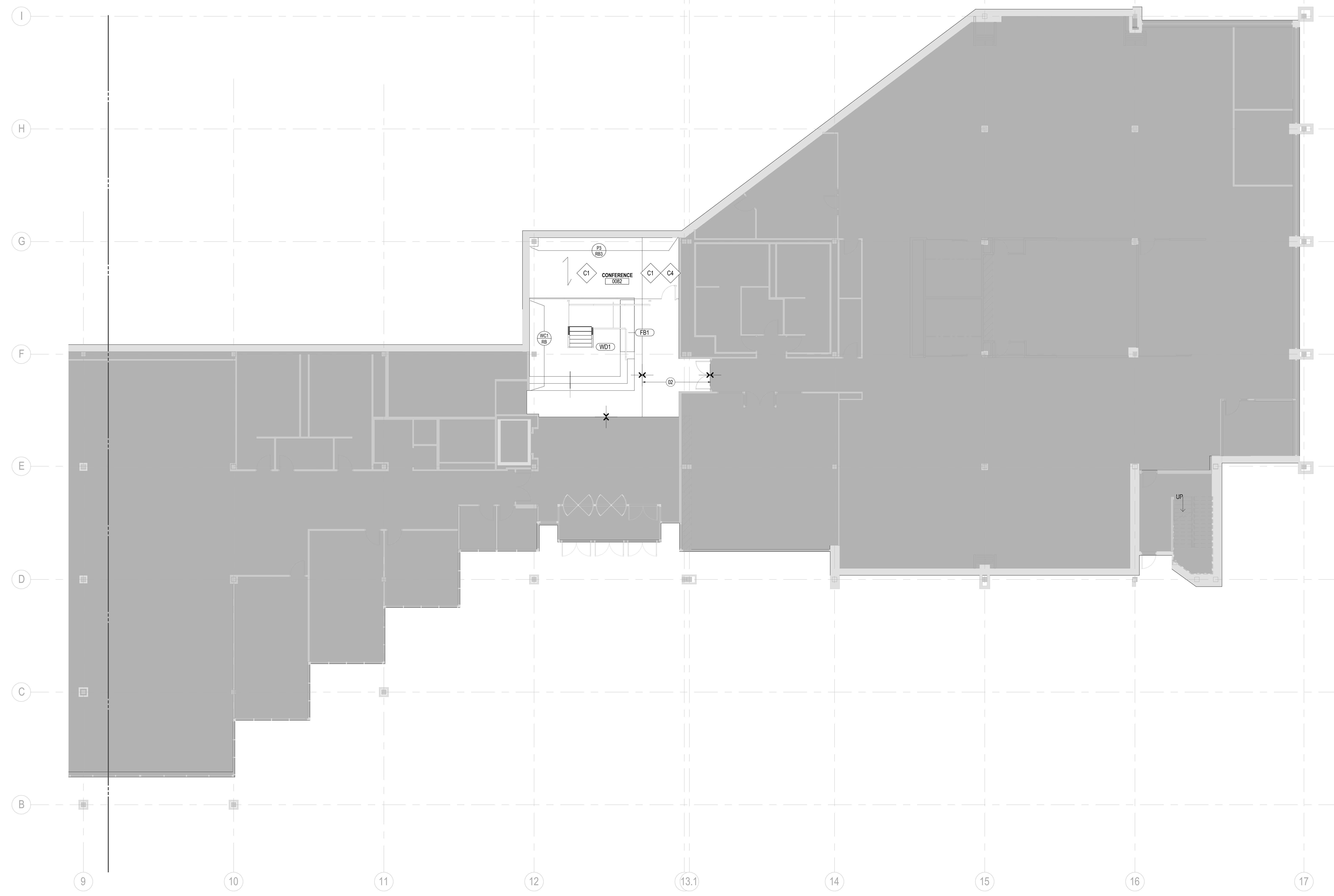
01 FINISH PLAN - LEVEL 00 - EAST SCALE: 1/8" = 1'-0"

SHEET NOTES 02 REFER TO DETAIL 05/A08.200 FOR CARPET TRANSITION INSTALL. CONTRACTOR TO COORDINATE ON SITE MOCKUP INSTALL OF CARPET TRANSITION FOR ARCHITECTS APPROVAL PRIOR TO INSTALLATION OF FINAL PRODUCT.