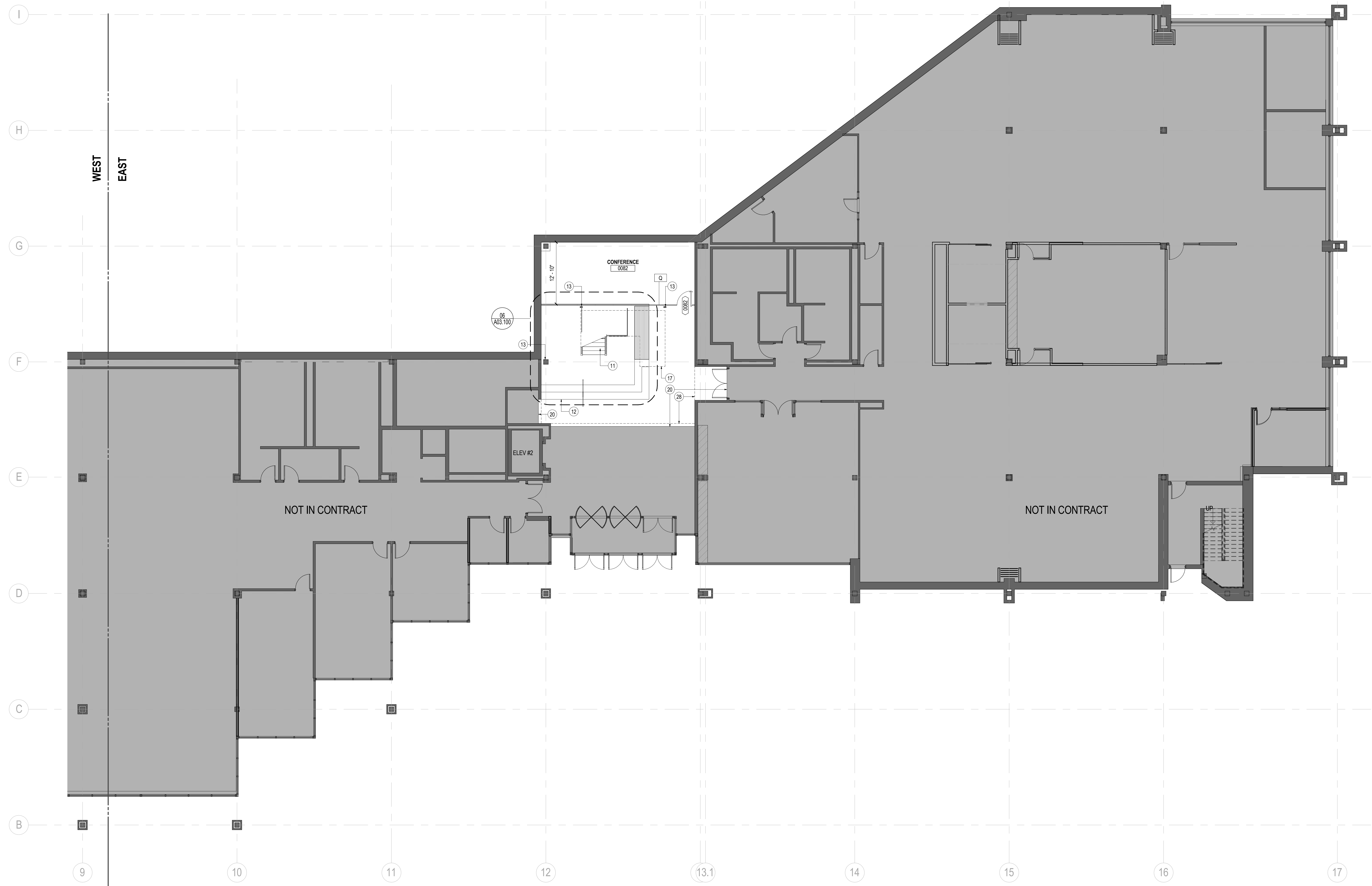
01 CONSTRUCTION PLAN - LEVEL 00 - EAST SCALE: 1/8" = 1'-0"