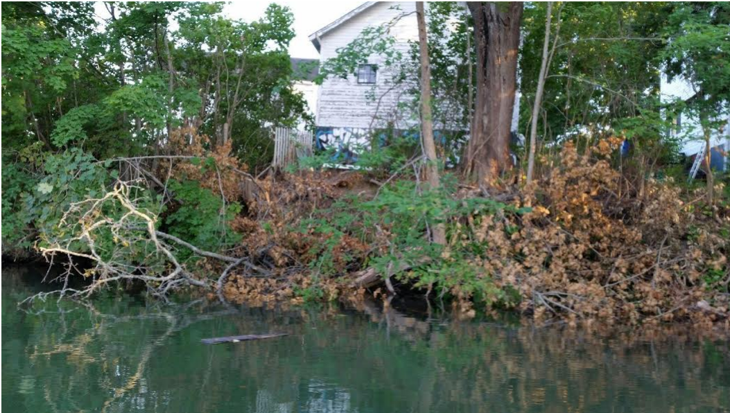
11 Garrison St pic: