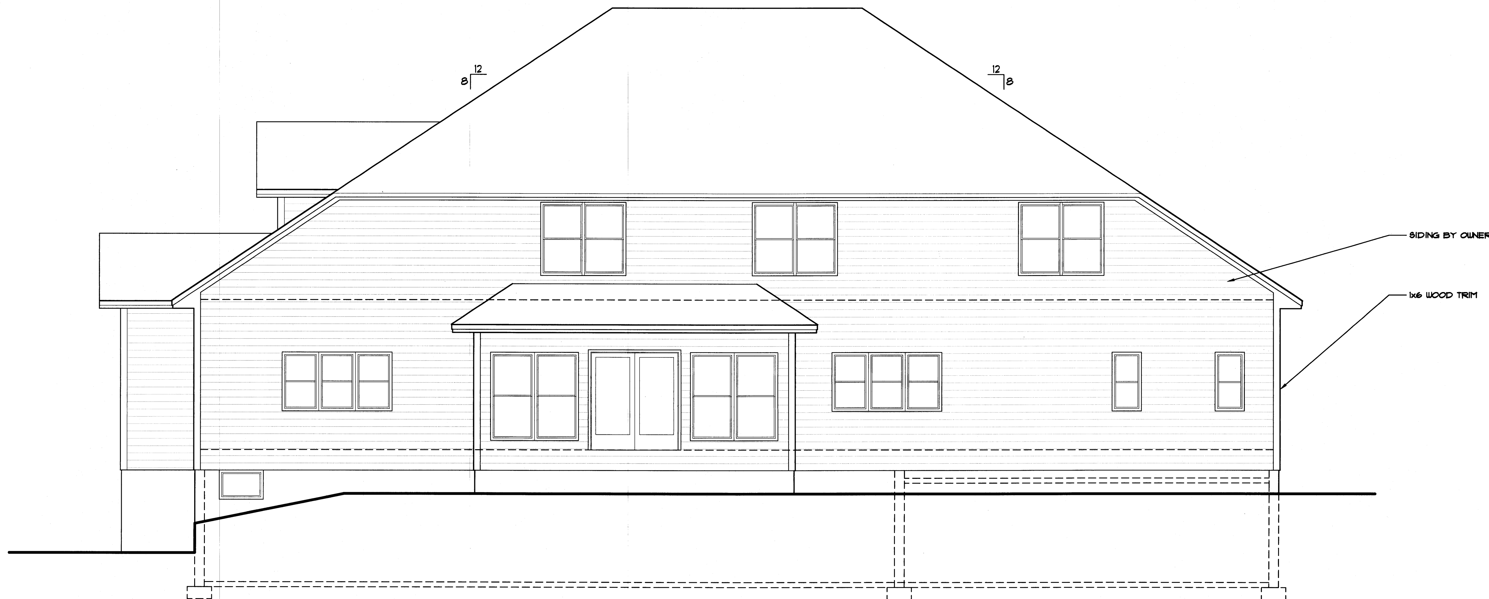
REAR ELEVATION SCALE: 1/4" = 1'-0"

NOTE: THIS DRAWING IS PROVIDED FOR INFORMATIONAL PURPOSES ONLY. IF USED FOR CONSTRUCTION, THE CONTRACTOR ASSUMES ALL RESPONSIBILITY FOR LOCAL CODE COMPLIANCE. ALL DRAWINGS, PLANS, SKETCHES ETC. ARE PROVIDED TO OUR CLIENTS BASED UPON INFORMATION PROVIDED BY THE CLIENT AND DRAWN IN ACCORDANCE WITH COMMON BUILDING PRACTICES AND LOCAL CODES. NONE OF THE EMPLOYEES OF FMC CADD DRAFTING SERVICES, INC. ARE REGISTERED ARCHITECTS, ENGINEERS OR LAND SURVEYORS. ALL DIMENSIONS AND SPECIFICATIONS SHOULD BE VERIFIED BY CLIENT AND/OR CONTRACTOR BEFORE ACTUAL CONSTRUCTION BEGINS. F. DIMENSIONS AND SPECIFICATIONS ARE NOT VERIFIED BY CLIENT AND/OR CONTRACTOR BEFORE ACTUAL CONSTRUCTION BEGINS. FMC CADD DRAFTING SERVICES, INC. WILL BE HELD HARMLESS AND/OR REVISIONS MADE TO PLANS BY CLIENT AND/OR CONTRACTOR.