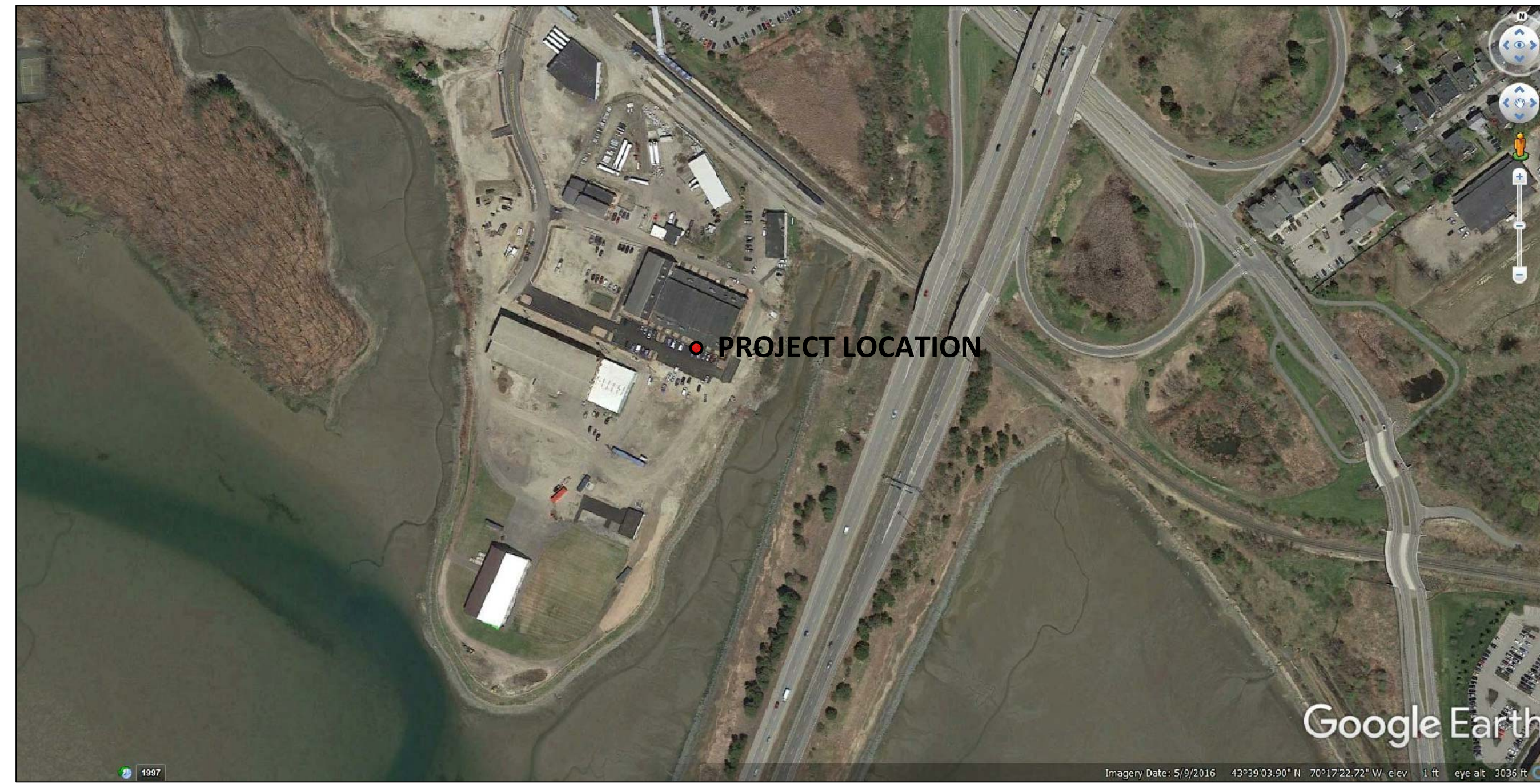
1 PROJECT LOCATION - 4 THOMPSONS POINT SUITE #108 PORTLAND MAINE SCALE: N.T.S.