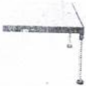
2' x 4' Deck Section

Sizes available for the Multi-Stage decks include the popular 4' square section, a 2' x 4' section and a 45° corner section. Standard decks include a 3/4" AC exterior plywood stained in gray enclosed in a steel frame edge protector. Other deck options are available.