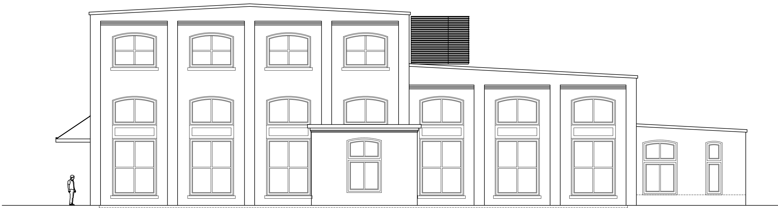
2 BRICK SOUTH - WEST ELEVATION A200 SCALE: 3/32" = 1'-0"

BRICK SOUTH THOMPSON'S POINT PORTLAND, MAINE OWNER: FOREFRONT PARTNERS I, LP