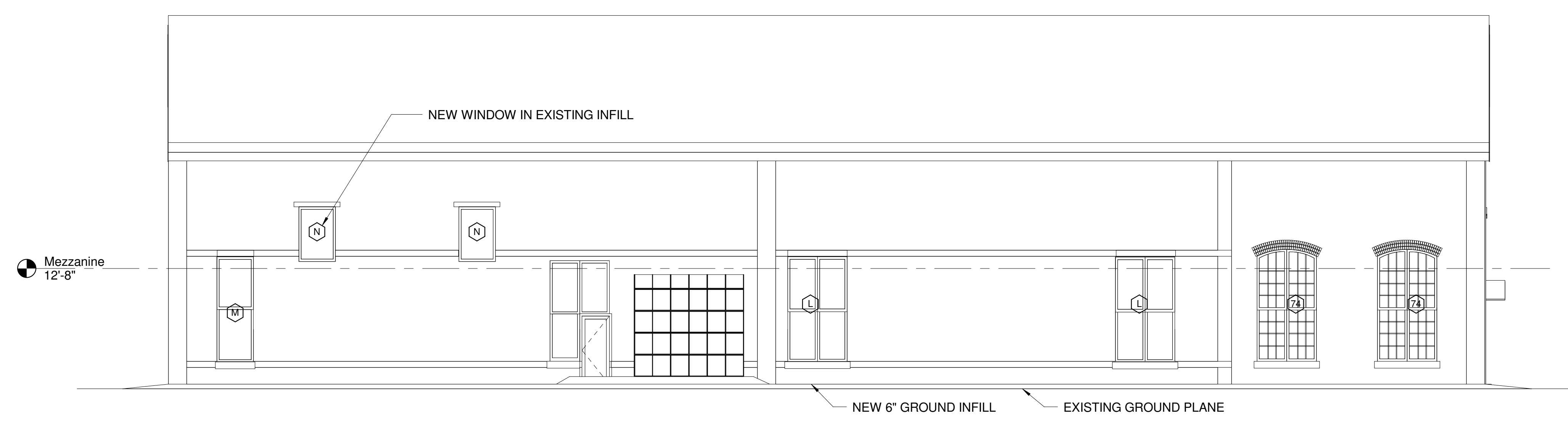
2 New Construction - West Elevation 1/8" = 1'-0" 0 2' 4' 8' 16'

GENERAL NOTE: ALL WINDOWS & DOORS TO BE REMOVED. ALL WINDOWS TO BE REPLACED. NEW DOORS TO BE INSTALLED WHERE SHOWN.