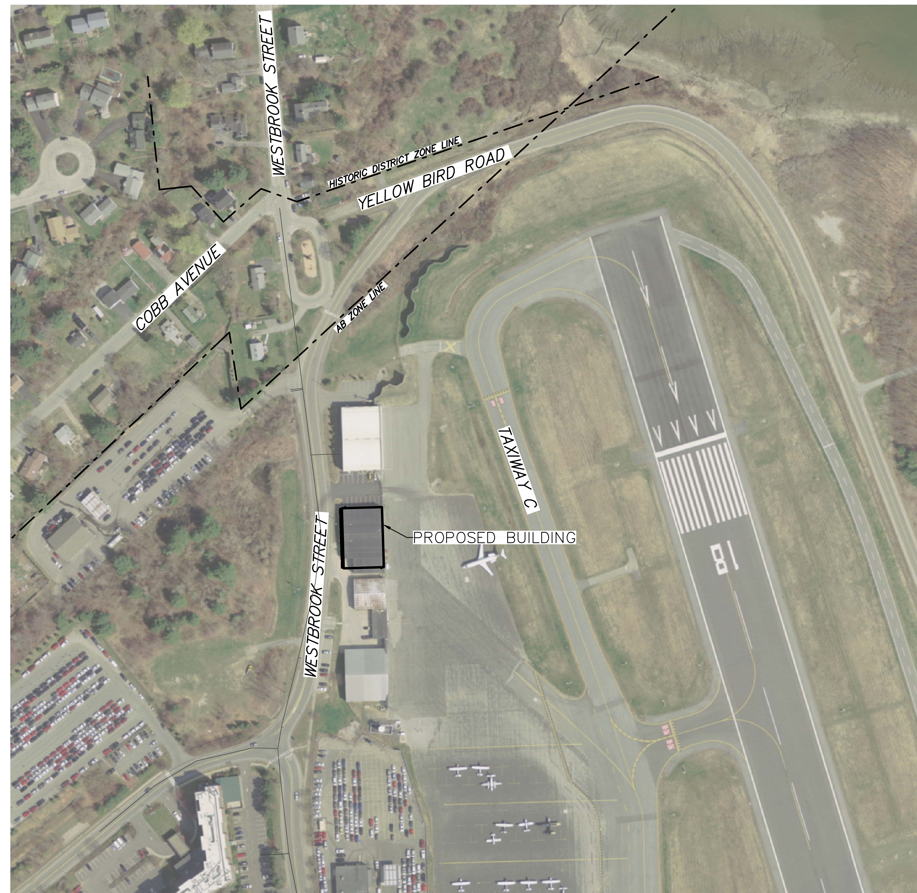
AREA PLAN SCALE: 1" = 120'