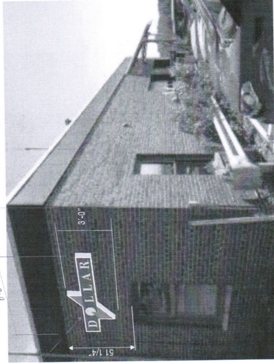
DIGITALLY ALTERED PHOTO SHOWING PROPOSED NEW BA-40 S/F WALL SIGN

LOCATION OF PROPOSED DOLLAR BA-40 S/F WALL SIGN