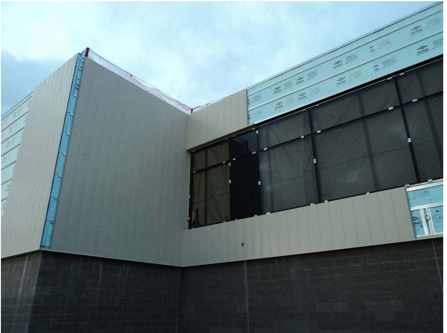
Curtainwall Framing, Dens Glass, and Waterproofing at West Exterior