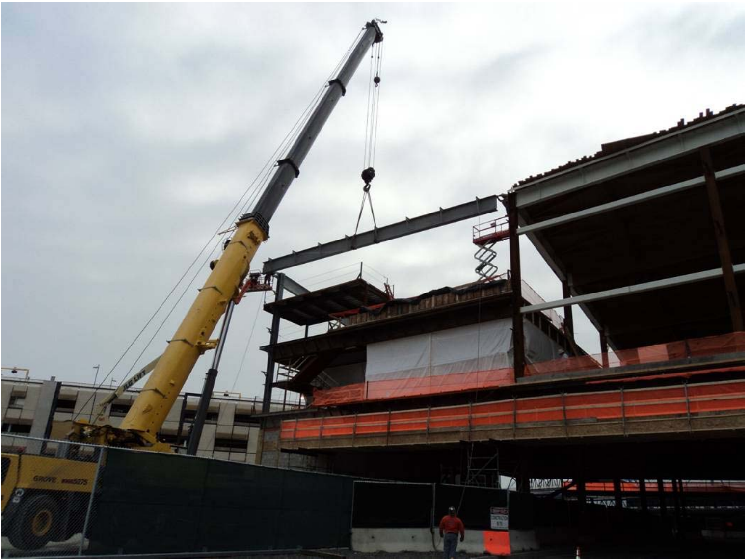
View of Terminal Expansion North End