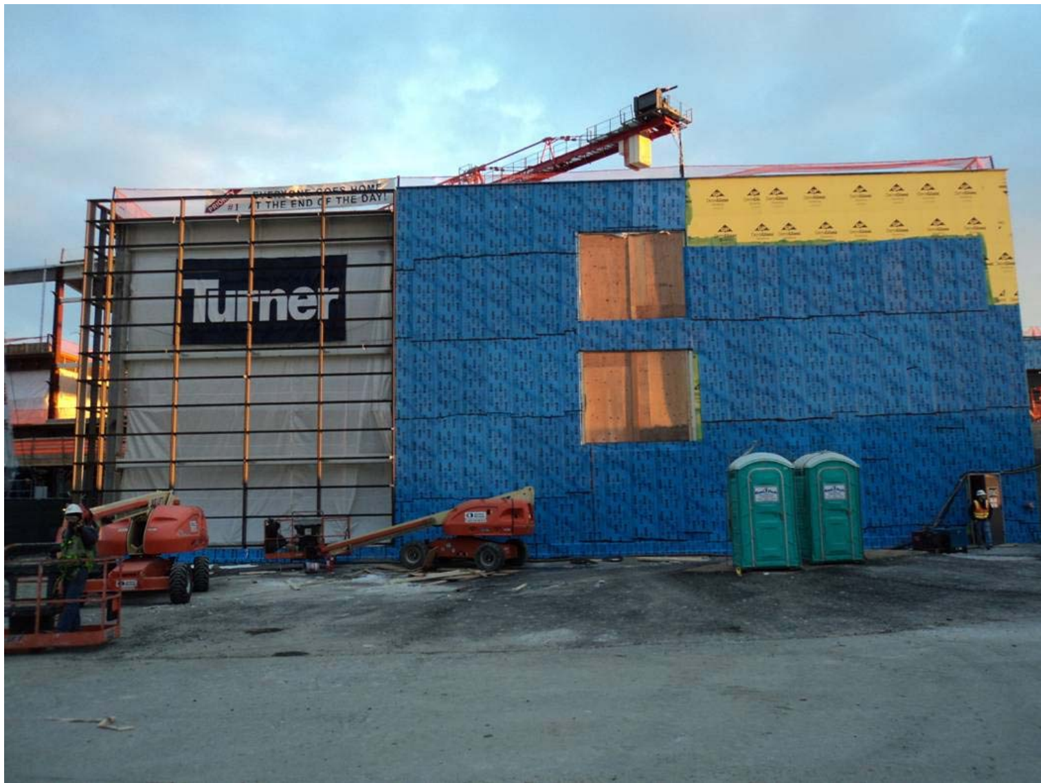
Curtainwall Framing Installation at Northwest Corner