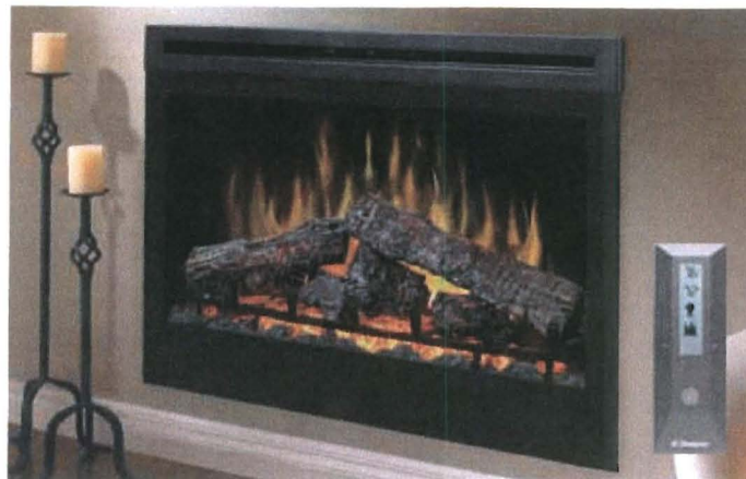
DF3033ST plug-in/direct wire firebox