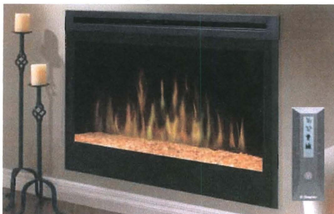
DFG3033 plug-in/direct wire firebox