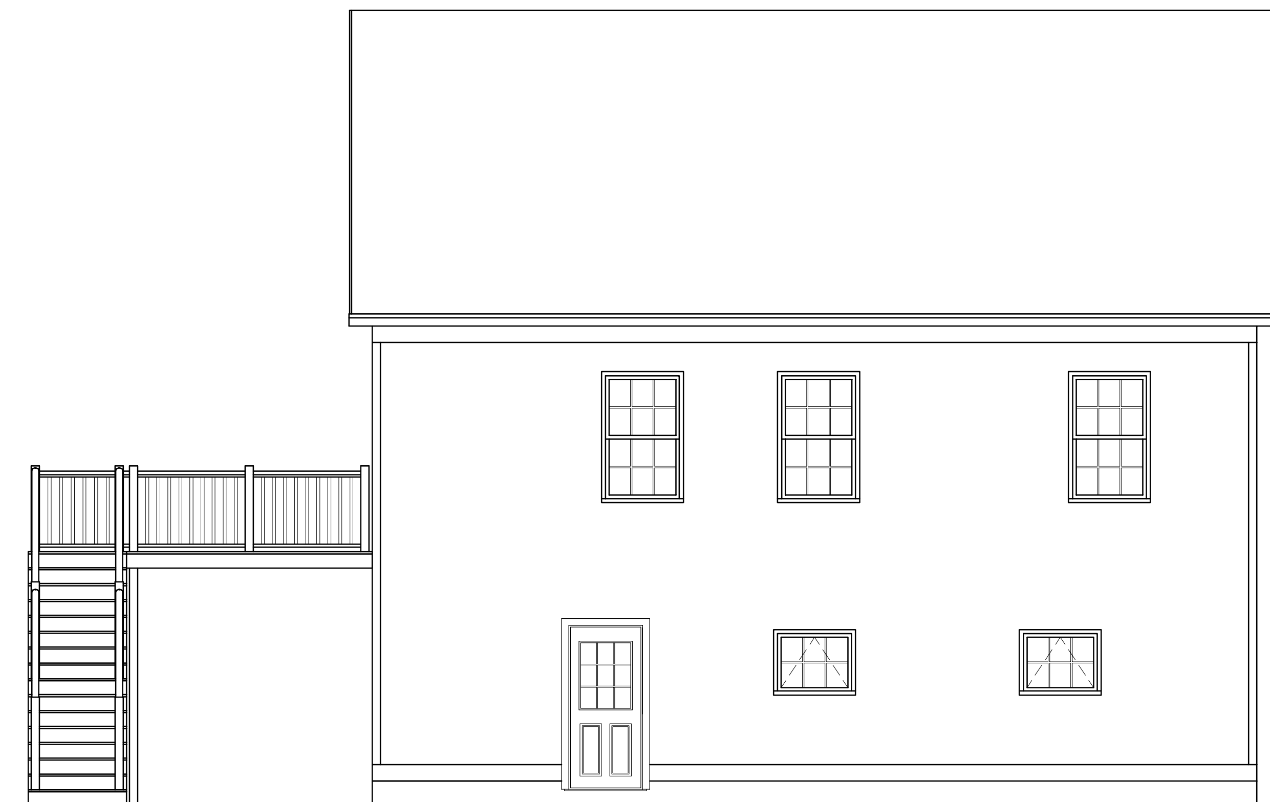
LEFT ELEVATION 1/4" = 1'-0"

CONSTRUCTION NOTE: CONTRACTOR TO VERIFY GRADE AND ALL DIMENSIONS IN FIELD BEFORE CONSTRUCTION. DESIGN SHOWN MAY DIFFER FROM ACTUAL FINISHED CONSTRUCTION. FINAL MATERIALS, WINDOW/DOOR LOCATIONS AND SIZES, TO BE DETERMINED PER OWNER/CONT. OR LOCAL CODES.