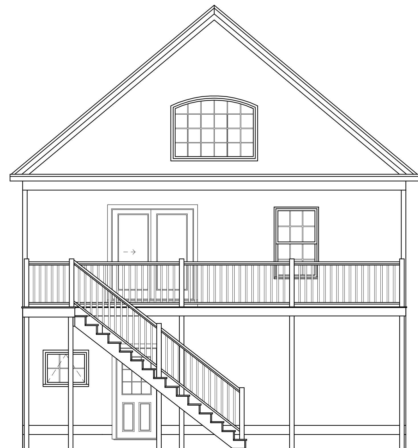
REAR ELEVATION 1/4" = 1'-0"

CONSTRUCTION NOTE: CONTRACTOR TO VERIFY GRADE AND ALL DIMENSIONS IN FIELD BEFORE CONSTRUCTION. DESIGN SHOWN MAY DIFFER FROM ACTUAL FINISHED CONSTRUCTION. FINAL MATERIALS, WINDOW/DOOR LOCATIONS AND SIZES, TO BE DETERMINED PER OWNER/CONT. OR LOCAL CODES.