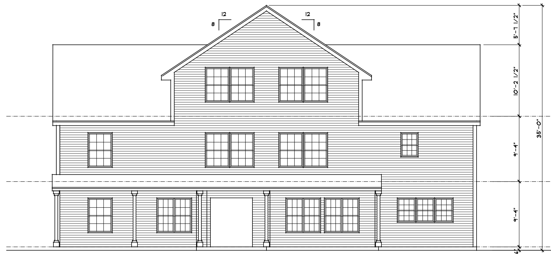
FRONT ELEVATION SCALE: 1/8" = 1'-0"