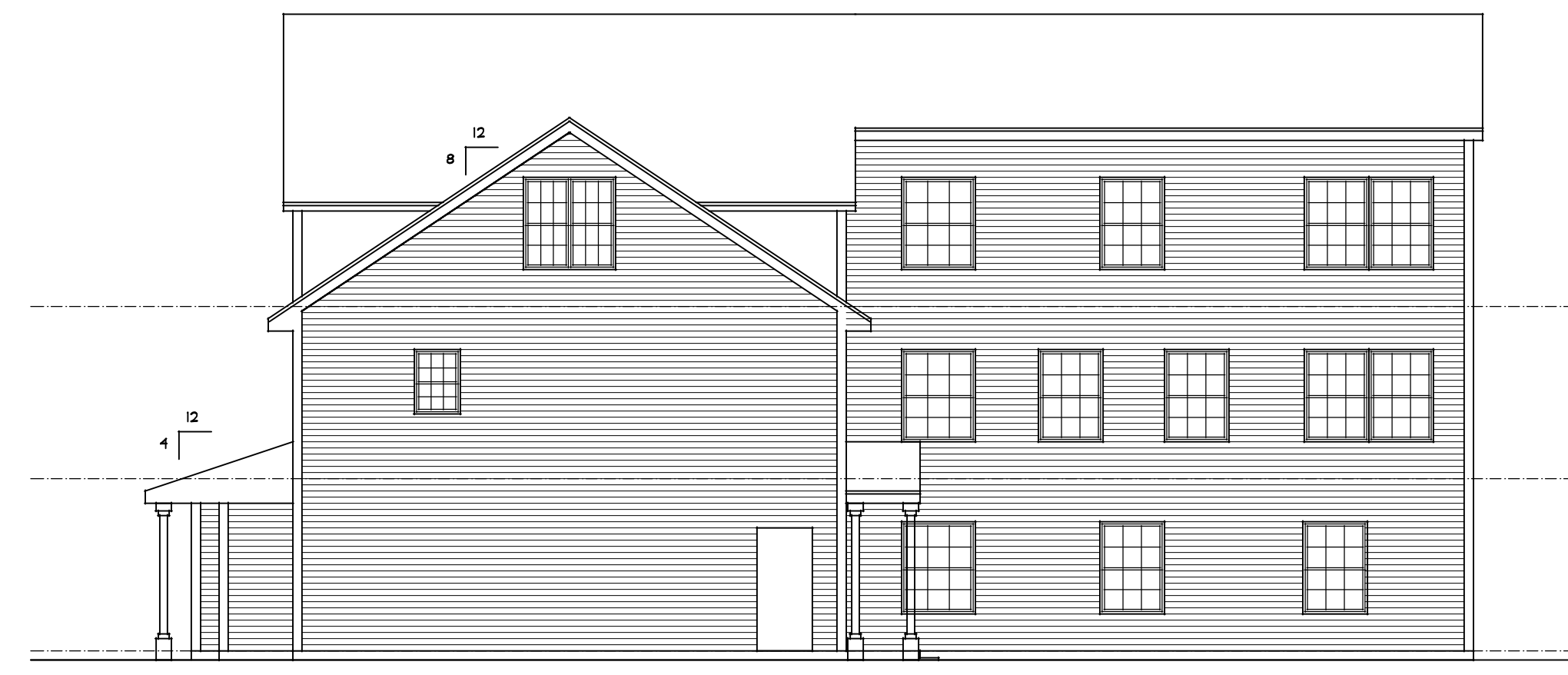
RIGHT SIDE ELEVATION SCALE: 1/8" = 1'-0"