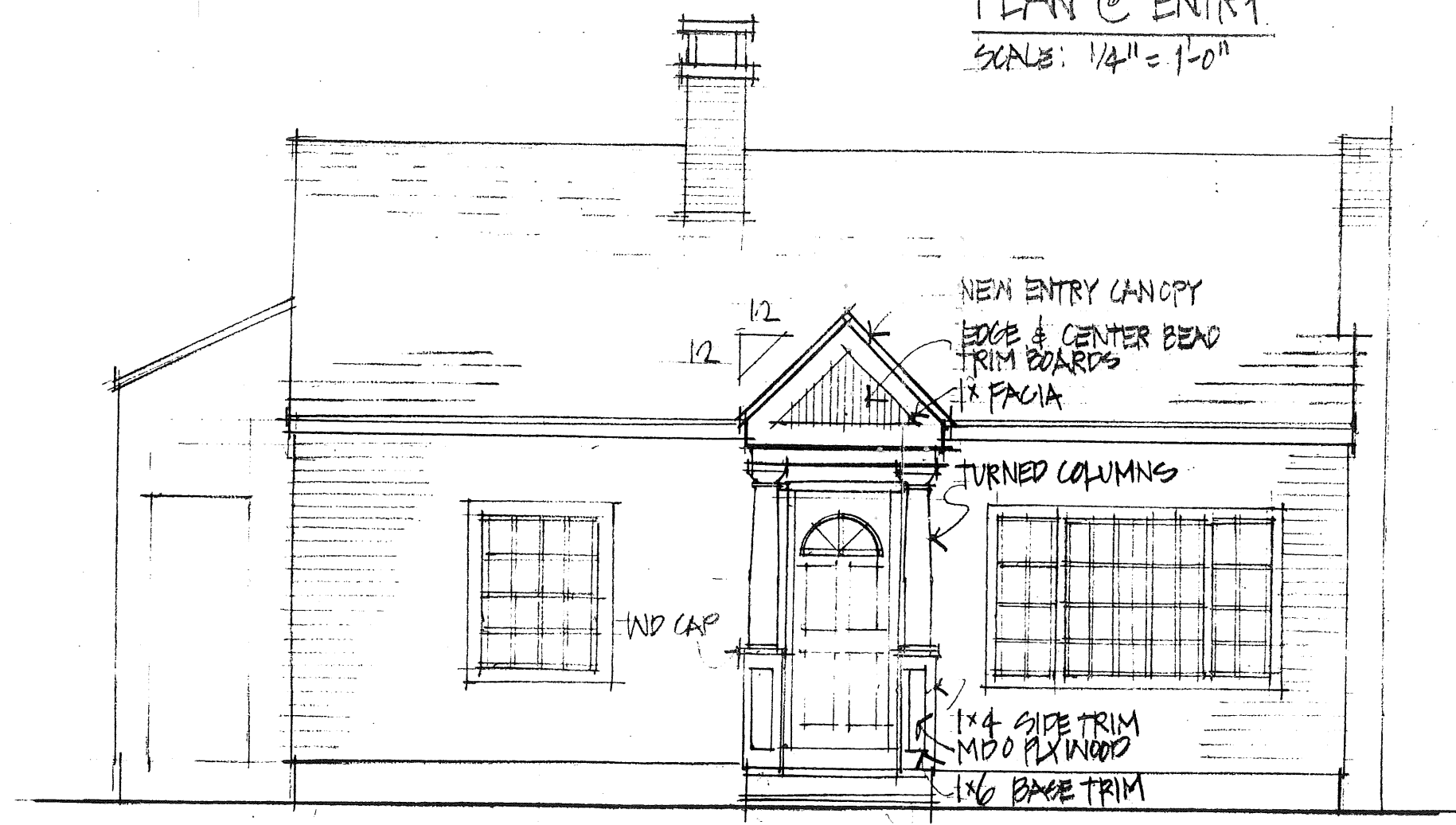
ELEVATION @ ENTRY SCALE: 1/4" = 1'-0"

NOTE: REMOVE EXISTING HIP ROOF CANOPY AND WOOD BRACKETS