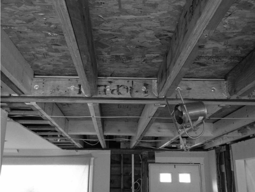
photo #1 showing new steel channel beam at center of second floor.