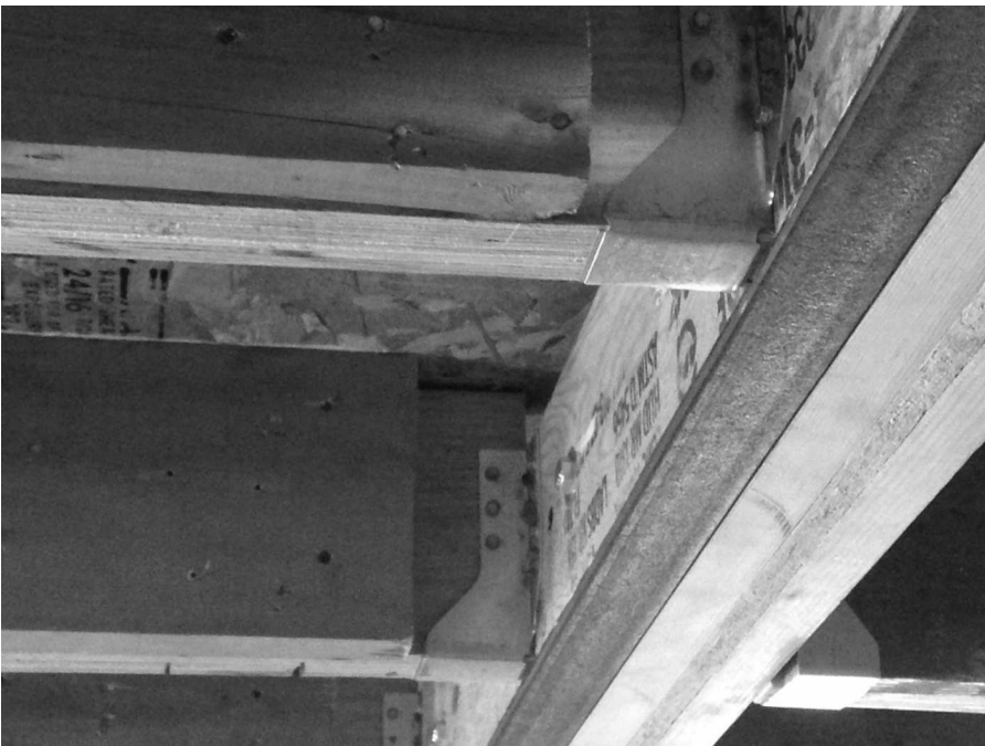
Photo #2 Showing reinforced floor joists and connection to new steel channel beam