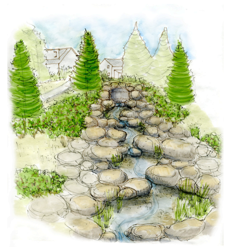
VIEW TOWARD OUTFALL - EXAMPLE