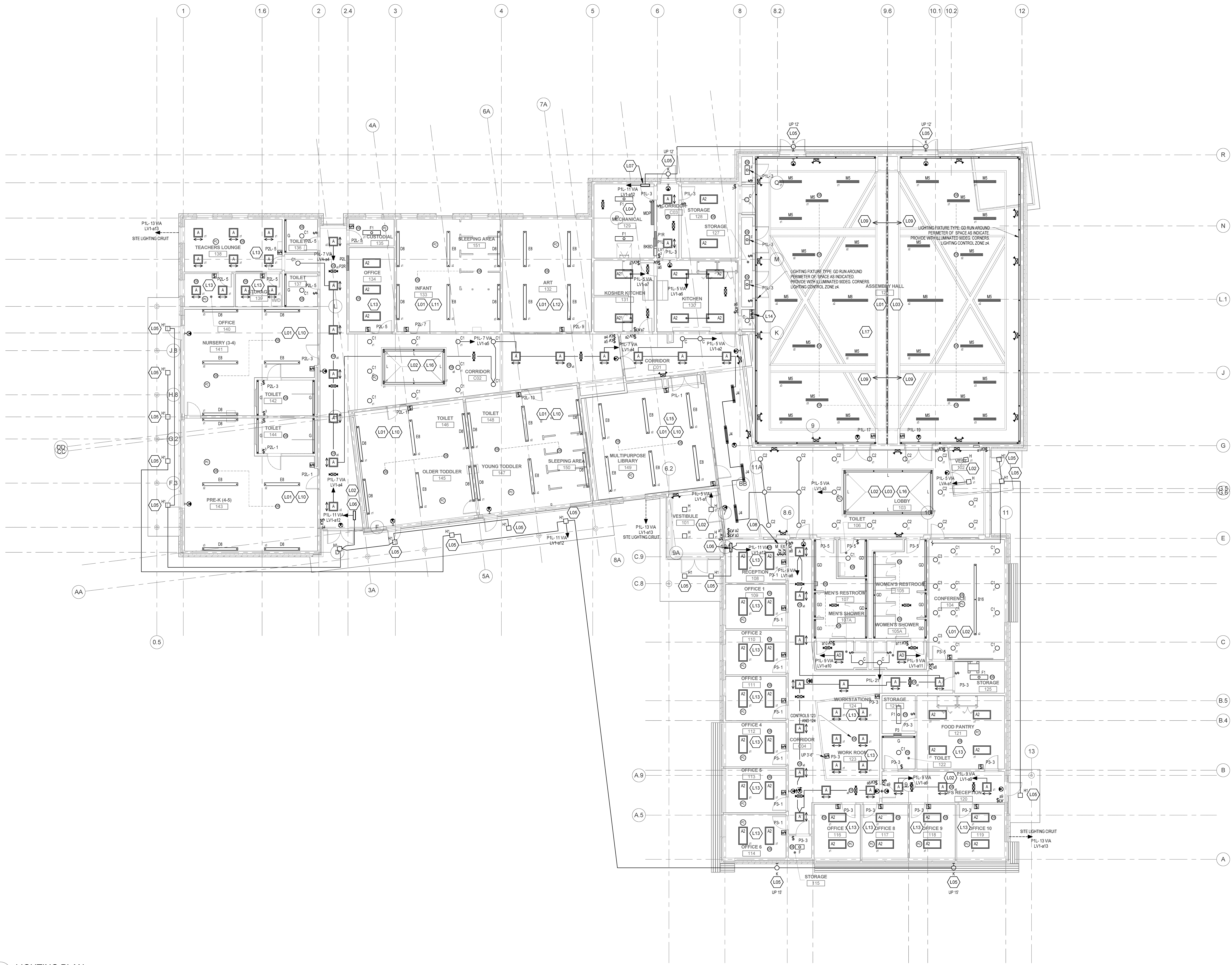
1 LIGHTING PLAN SCALE: 1/8" = 1'-0"