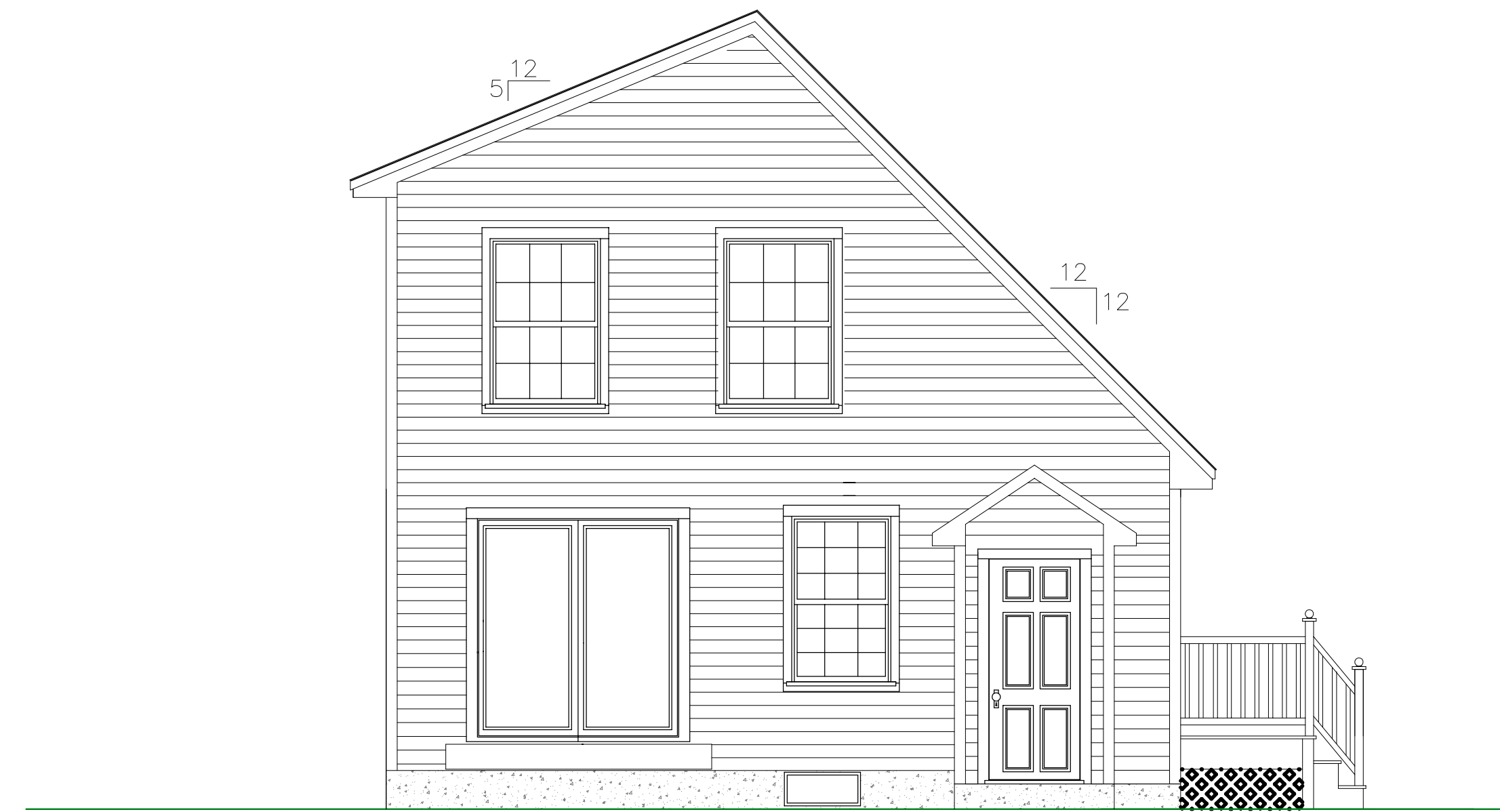
LEFT SIDE ELEVATION SCALE: 1/4"=1'-0"