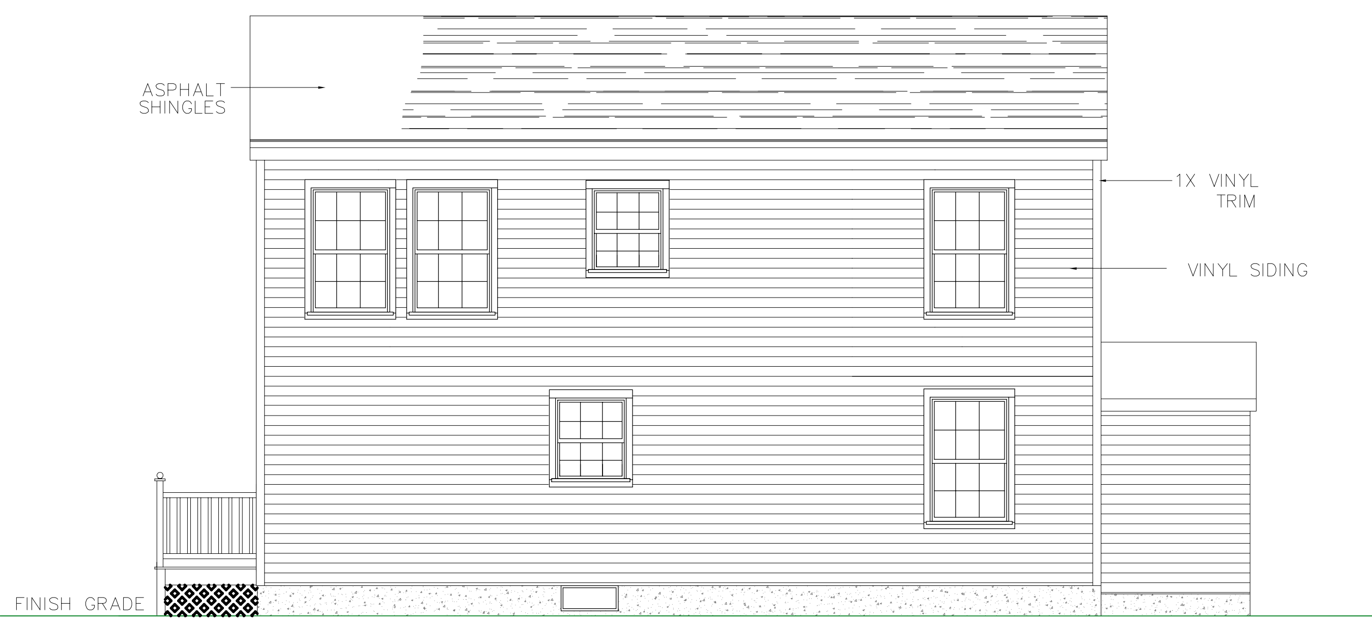
REAR ELEVATION SCALE: 1/4"=1'-0"