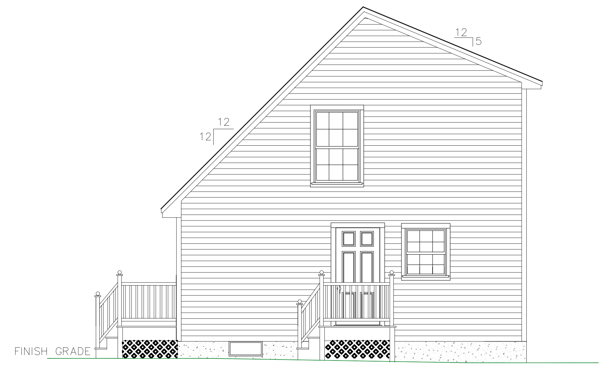
RIGHT SIDE ELEVATION SCALE: 1/4"=1'-0"