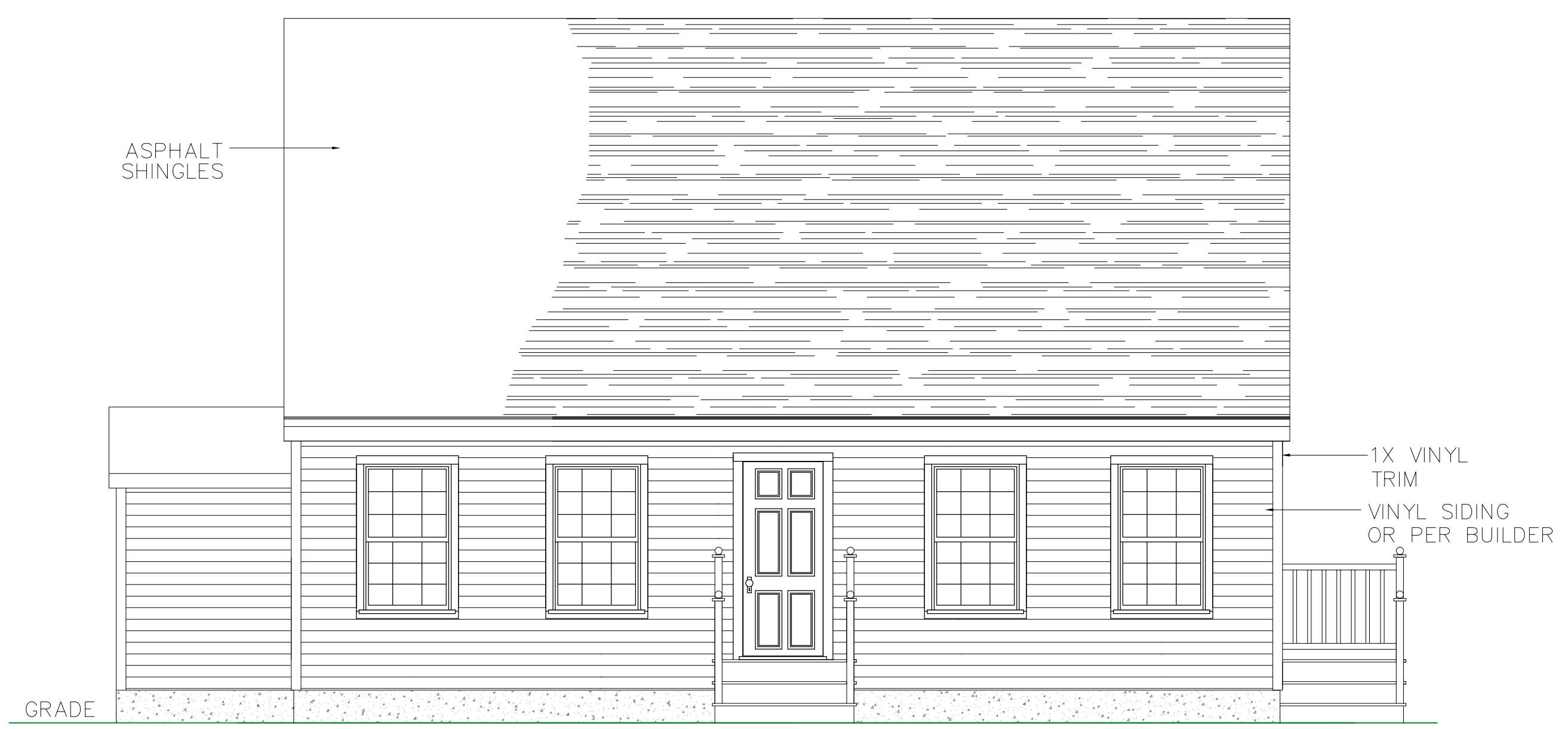
FRONT ELEVATION SCALE: 1/4"=1'-0"

2. 1. REVS: CODE: TOWN: PORTLAND DATE: 10-10-2017 SCALE: AS NOTED DESIGNED: SSA DRAWN: SSA TITLE: BUILDING ELEVATIONS FILE: SHEET: A2