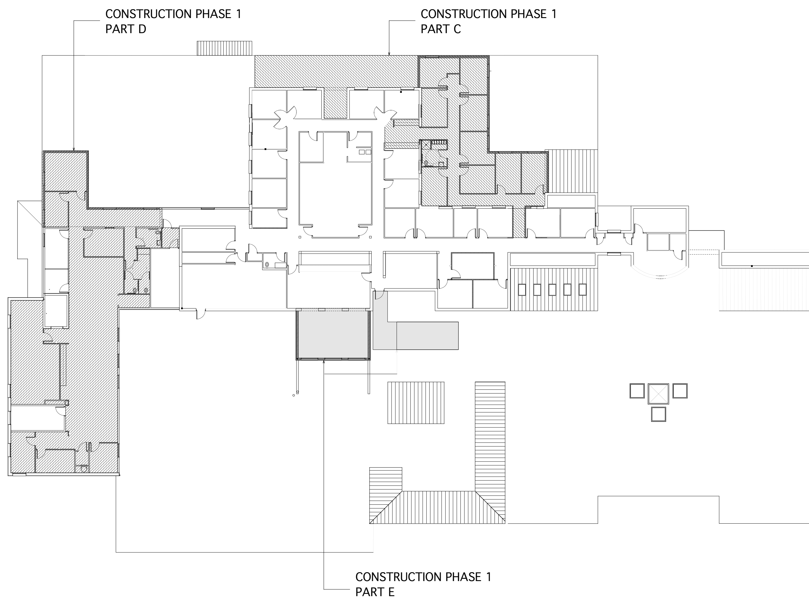
SECOND FLOOR - CONSTRUCTION PHASE 1