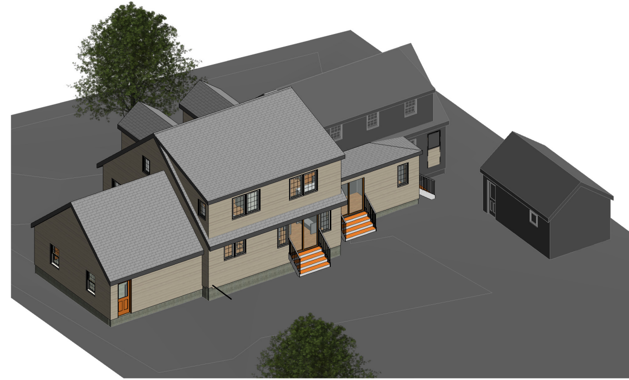
2 NW BIRDSEYE AS101