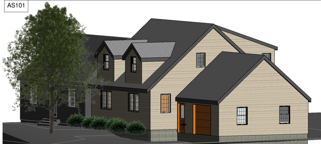
3 NORTH EAST AS101