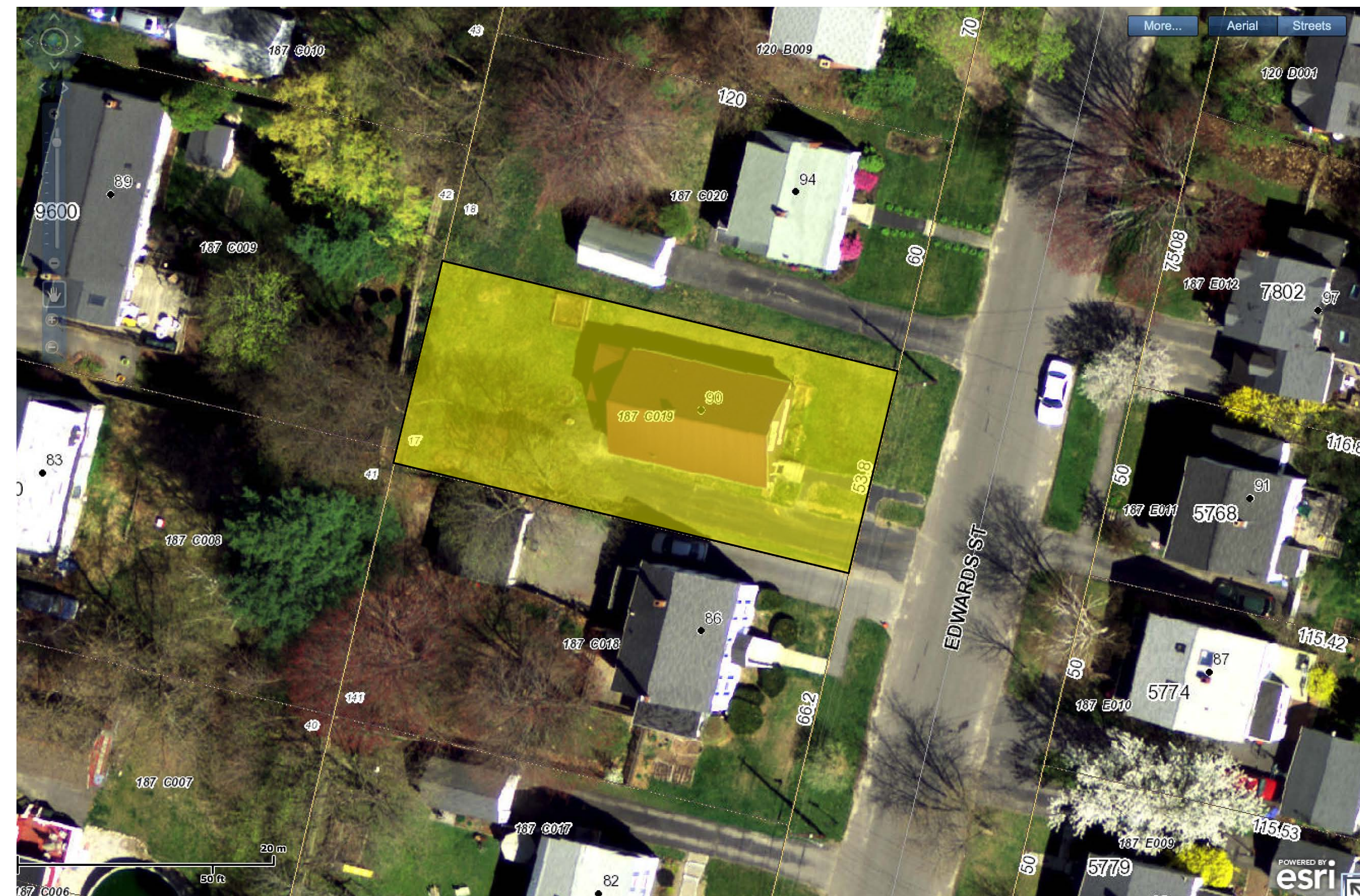
2 LOCATION PLAN - ENLARGED NOT TO SCALE

Client: Charles Tandy / Catherine Morrison Architect: Hellbent Design + Development Contractor: CSI Builders, Adam Rosenbaum Chart/Block/Lot: 187 C019001 Project Address: 90 Edwards Street Portland, Maine Zoning: R-3 Building Codes: IRC 2009 NFPA 101 / 2009 Site Area: 6455 +/- SF 0.1482 +/- ACRE Occupancy: Single Family Residential