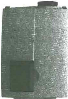
Pictured: E75CN, E110CN E75CP, E110CP