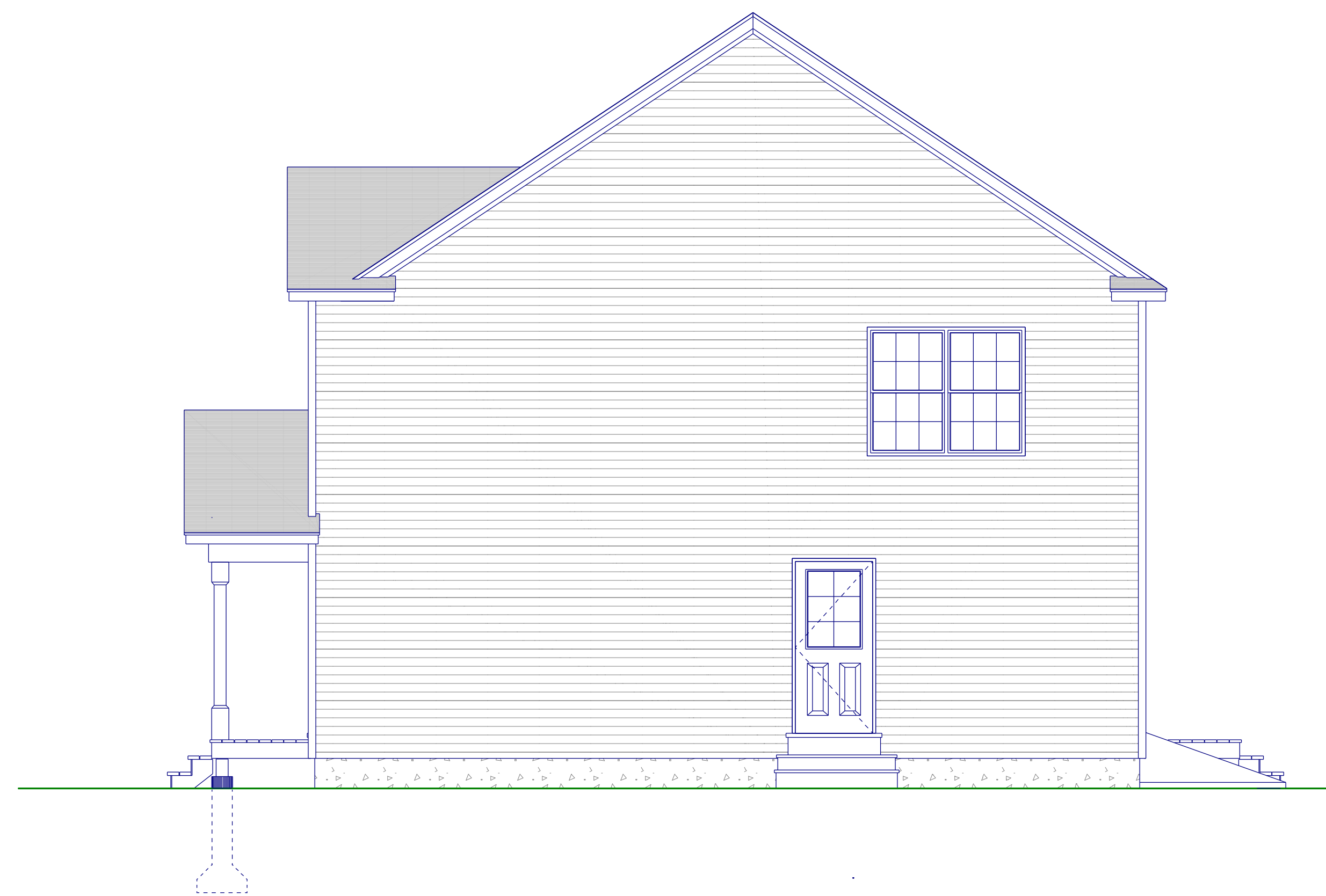
Right Elevation 1/4" = 1'-0"