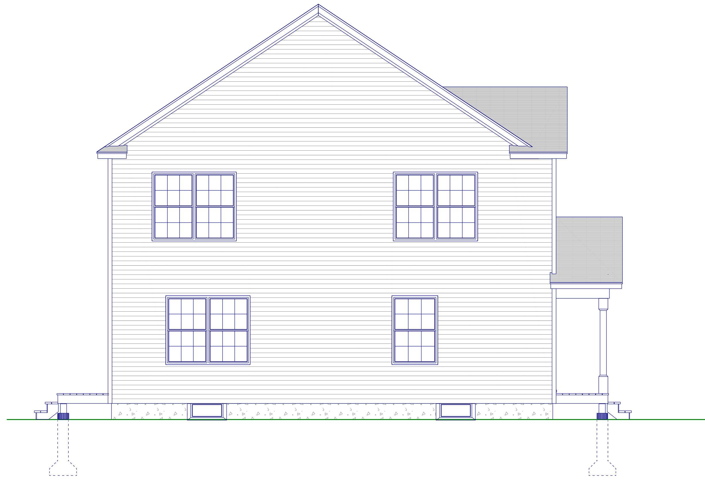
Left Elevation 1/4" = 1'-0"