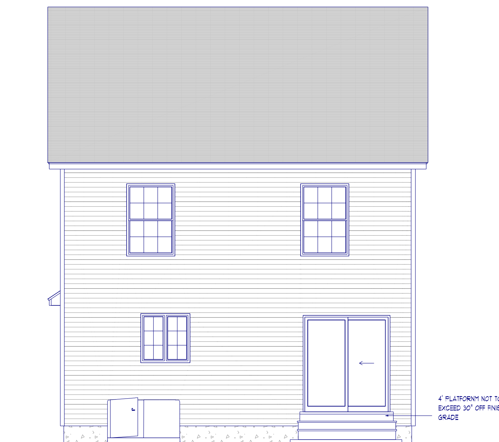
Rear Elevation 1/4" = 1'-0"