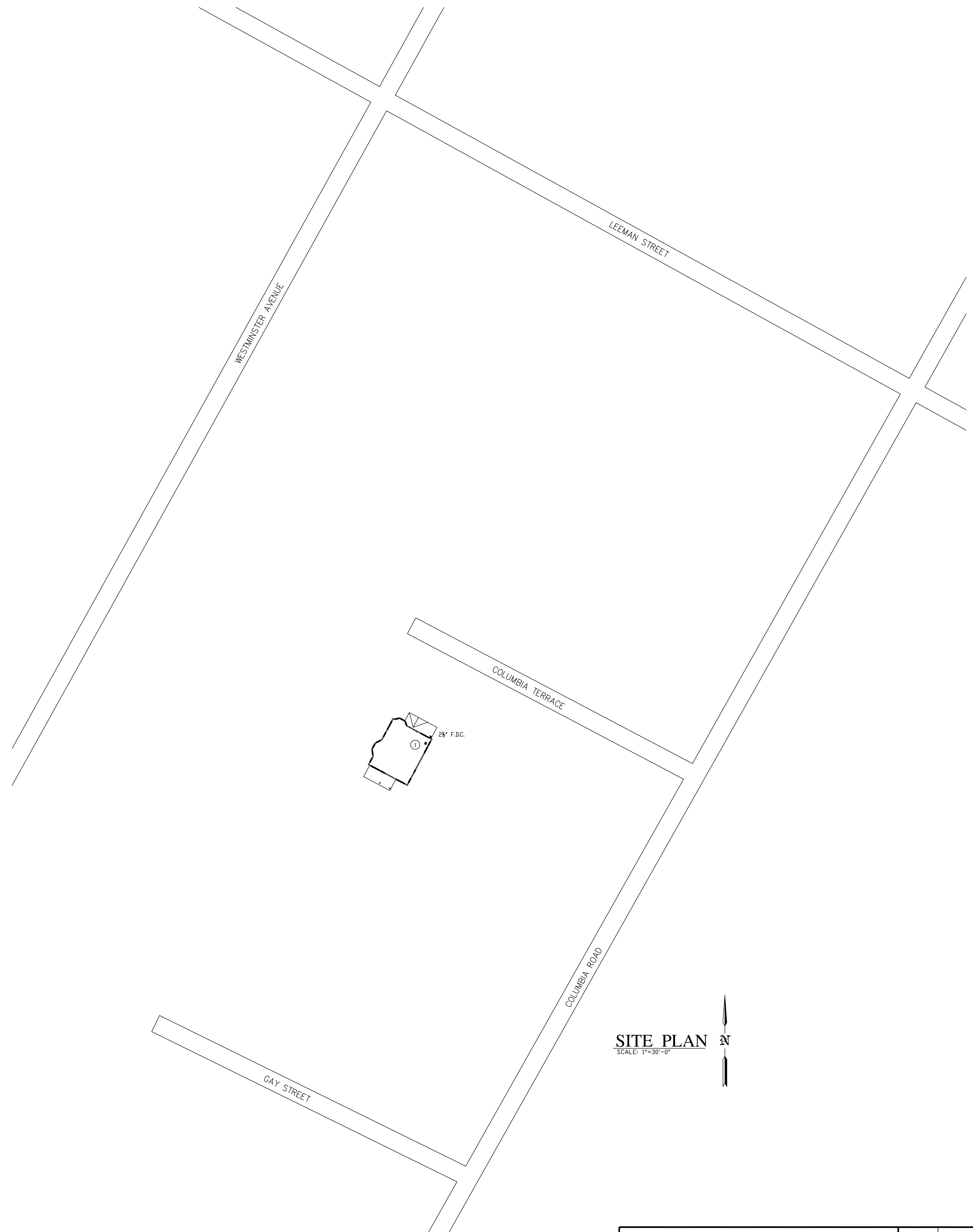
SITE PLAN SCALE: 1"=30'-0"

MAINTENANCE OF THE SPRINKLER SYSTEM IS THE RESPONSIBILITY OF THE OWNER. PROTECTION OF THE SPRINKLER SYSTEM AGAINST FREEZING IS THE RESPONSIBILITY OF THE OWNER.