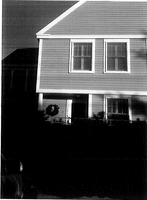
Three Windows, Front