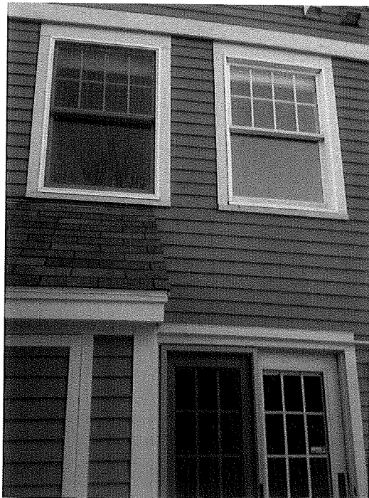
Two Window, Back

RECEIVED JAN 26 2011 Dept. of Building Inspections City of Portland Maine