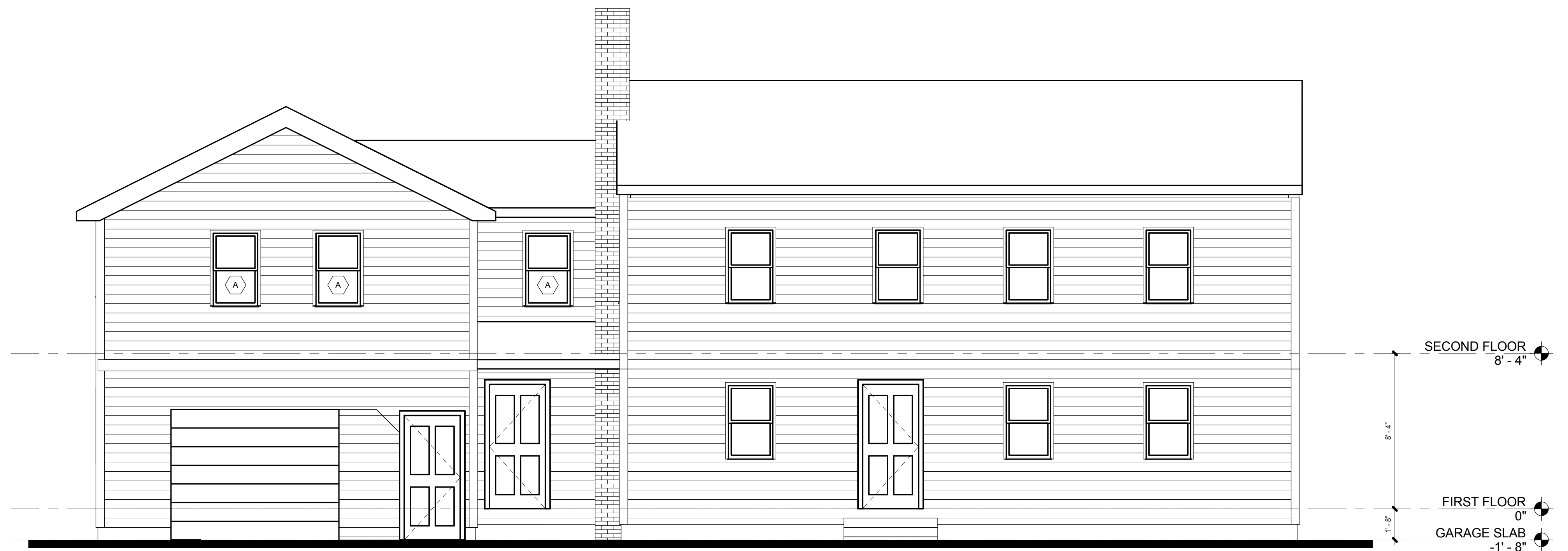
1 FRONT ELEVATION SCALE: 1/4" = 1'-0"