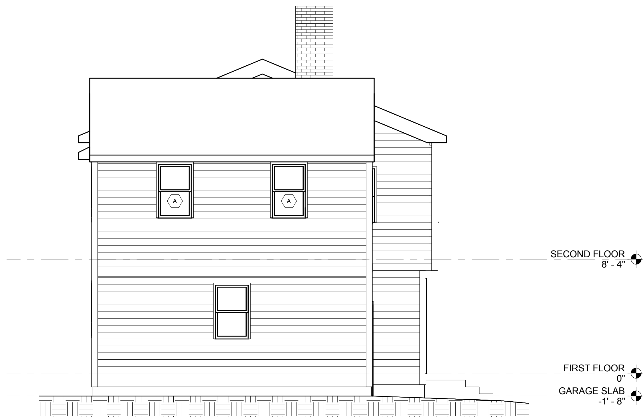
3 WEST ELEVATION SCALE: 1/4" = 1'-0"