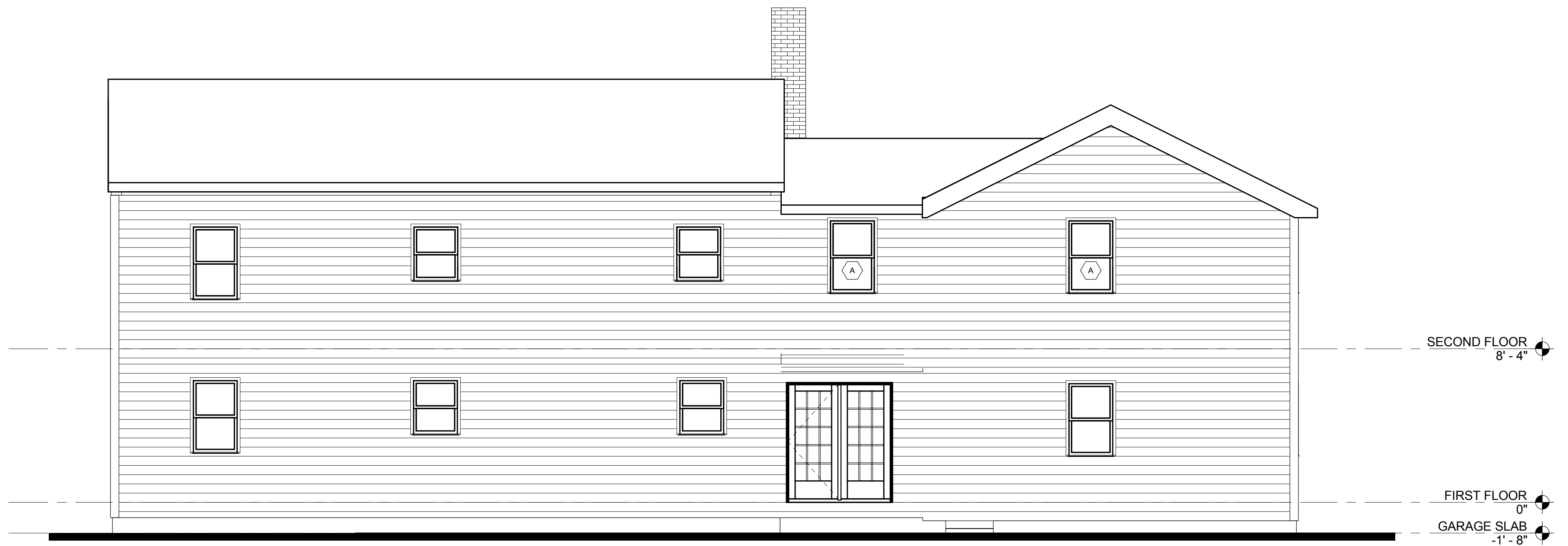
2 REAR ELEVATION SCALE: 1/4" = 1'-0"