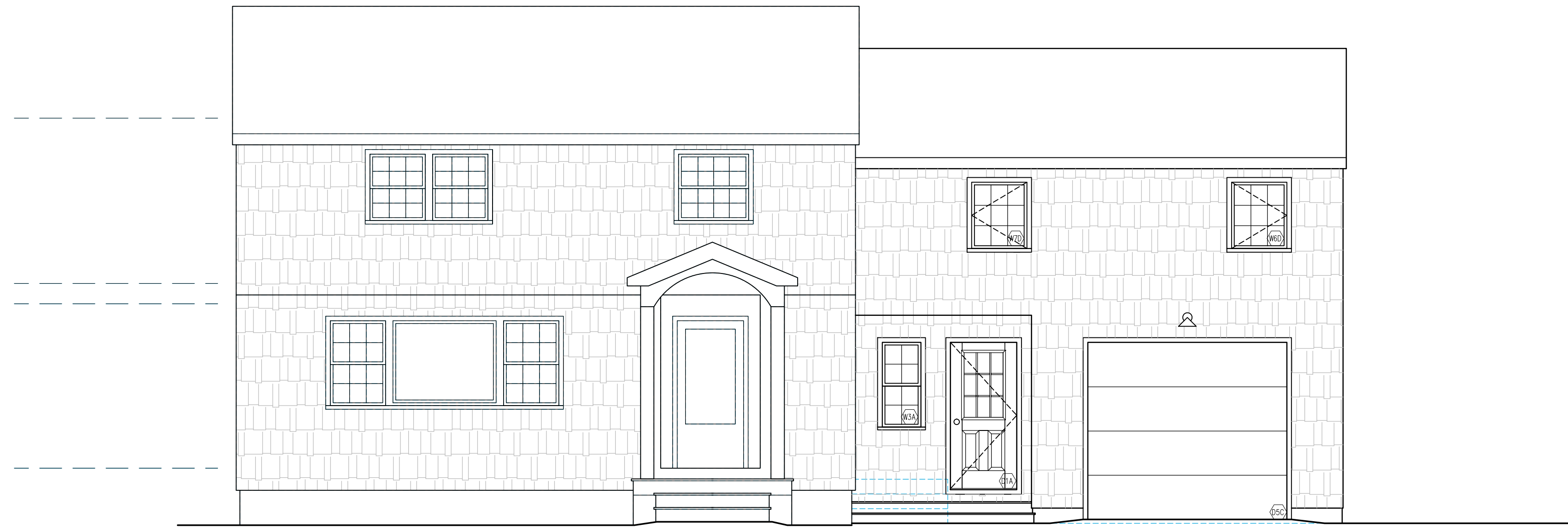
1 FRONT ELEVATION \frac{1}{4}'' = 1'-0''