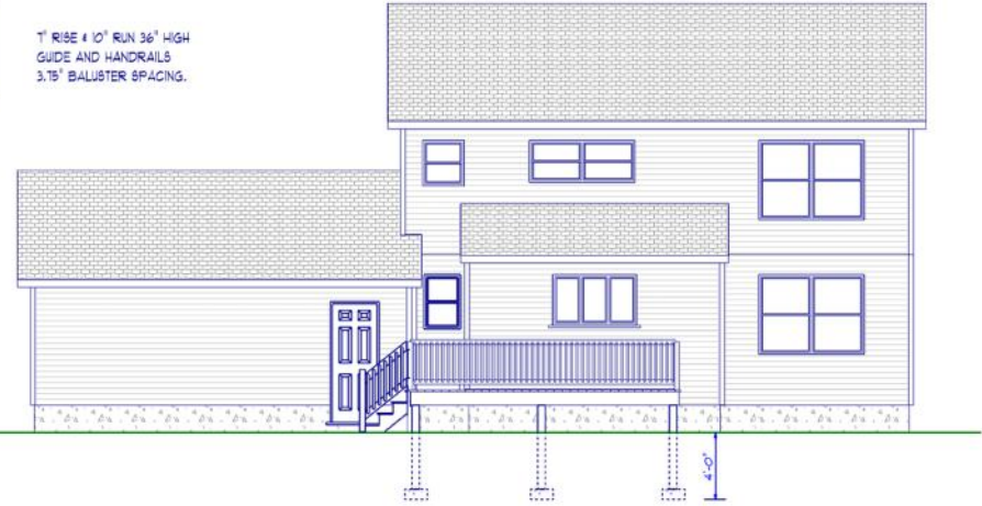
" A " PROPOSED ELEVATION 3/16" = 1'-0"

1" RISE x 10" RUN 36" HIGH GUIDE AND HANDRAILS 3.75" BALUSTER SPACING.