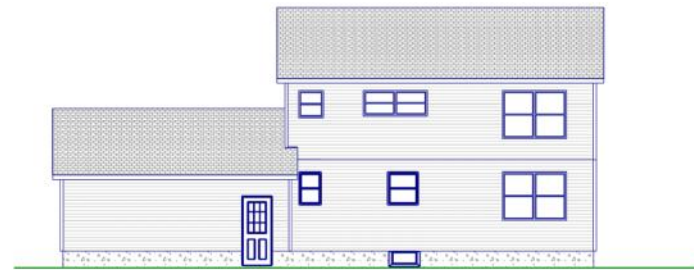
" A " EXISTING ELEVATION 1/8" = 1'-0"

Note: Owner to check plans for compliance with all applicable codes